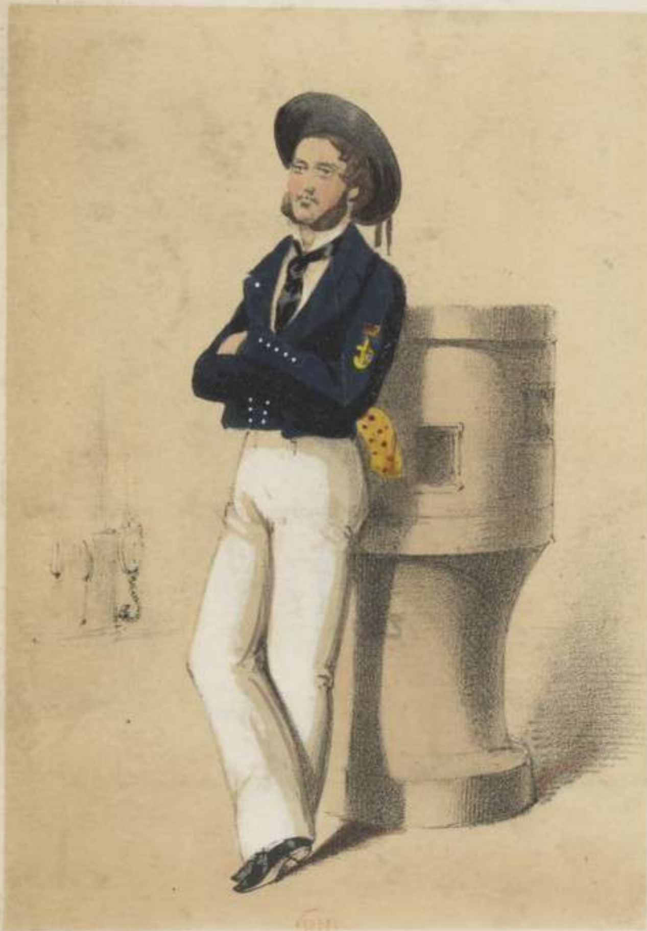
1 ST CLASS PETTY OFFICER