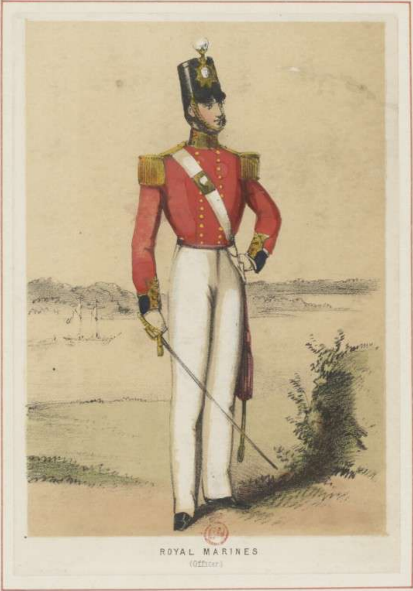
ROYAL MARINES (Officer)