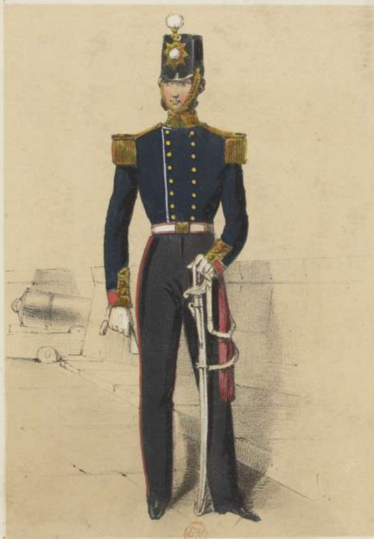
ROYAL MARINE ARTILLERY. (Officer)