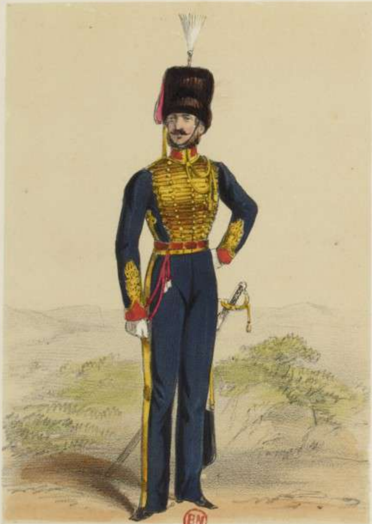
ROYAL HORSE ARTILLERY. (OFFICER.)