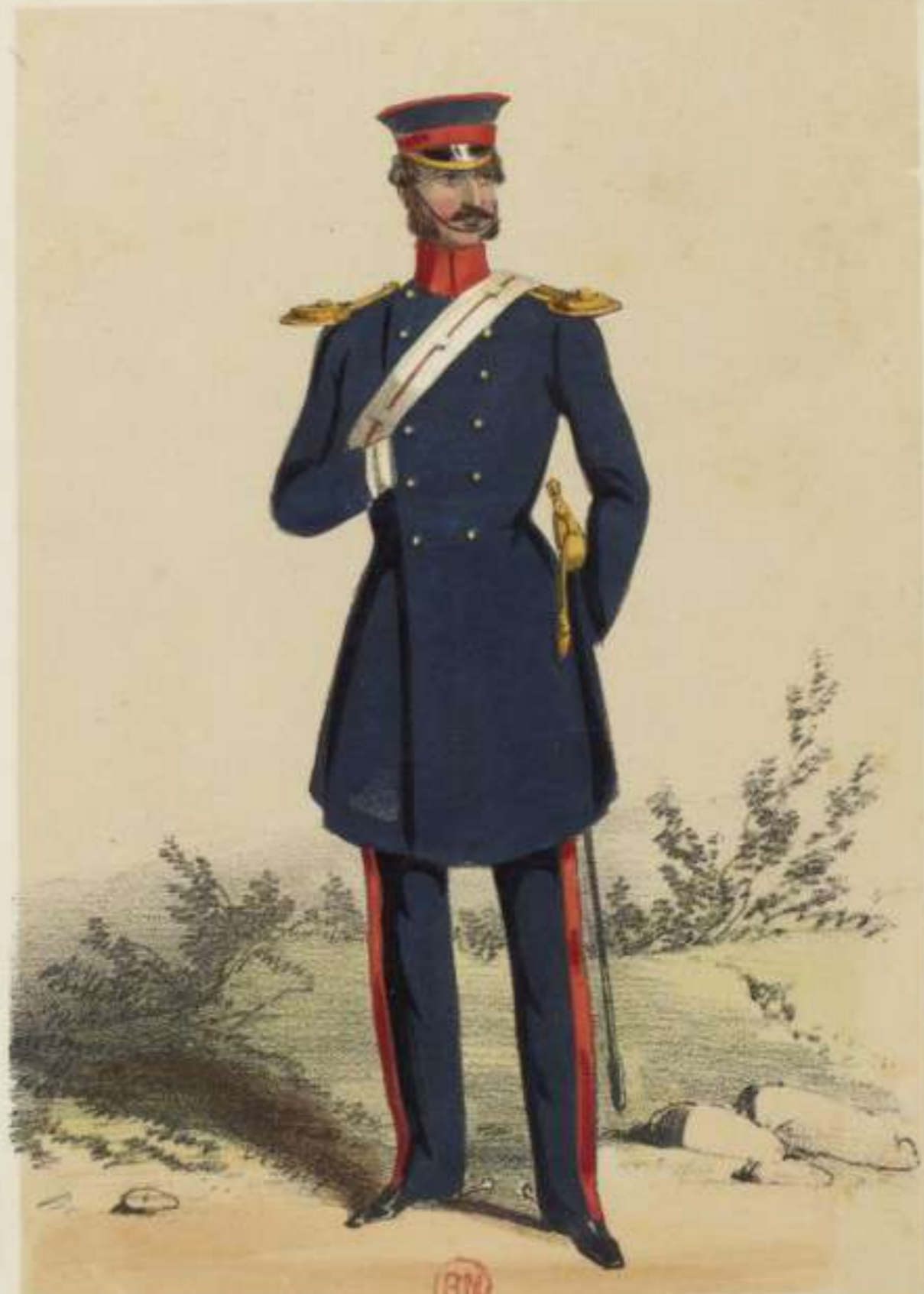
OFFICER OF HORSE GUARDS (Undress)