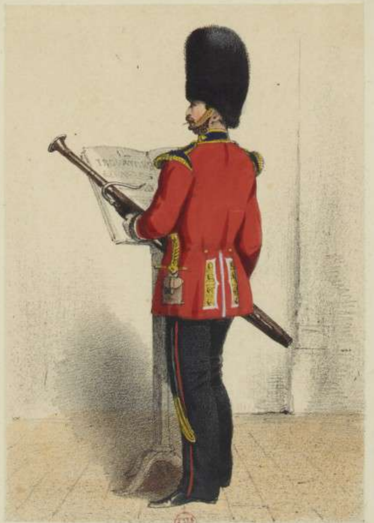
COLDSTREAM GUARDS. Private