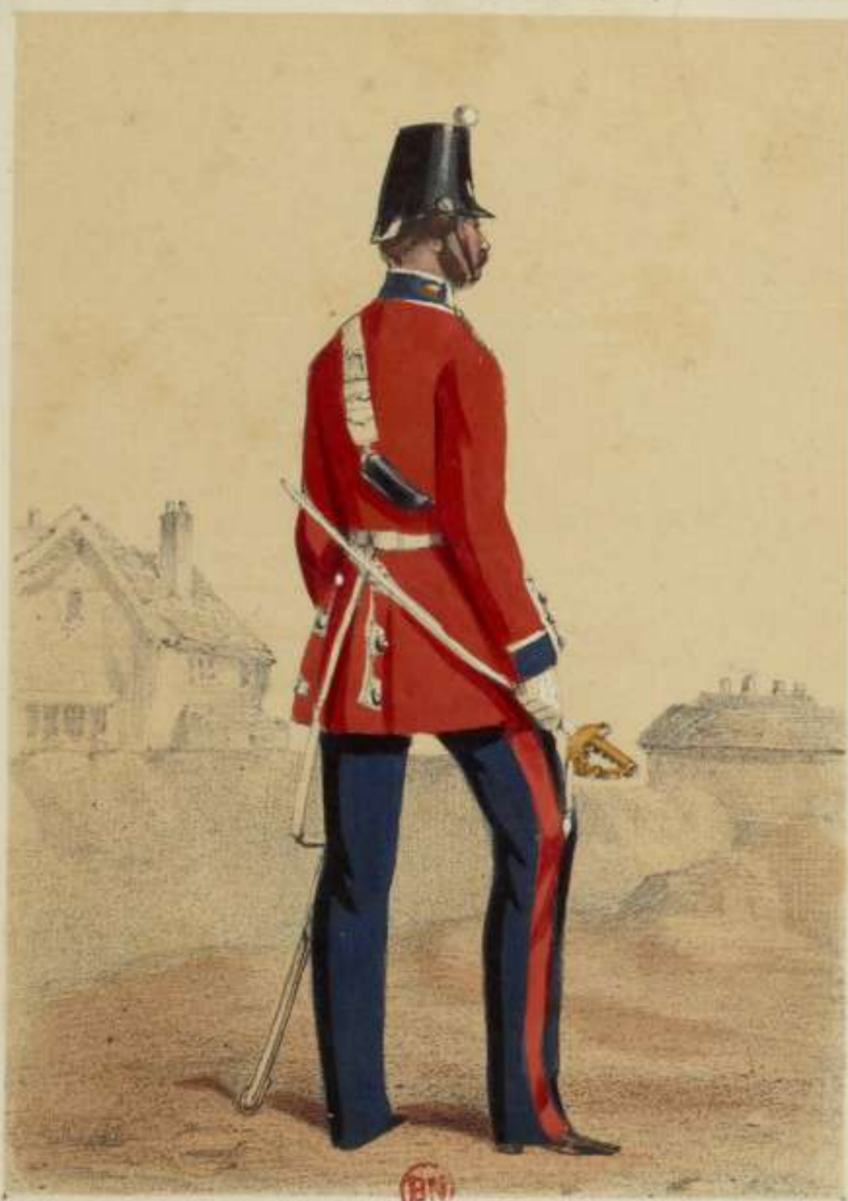
THE QUEENS OWN LIGHT INFANTRY. (Officer)