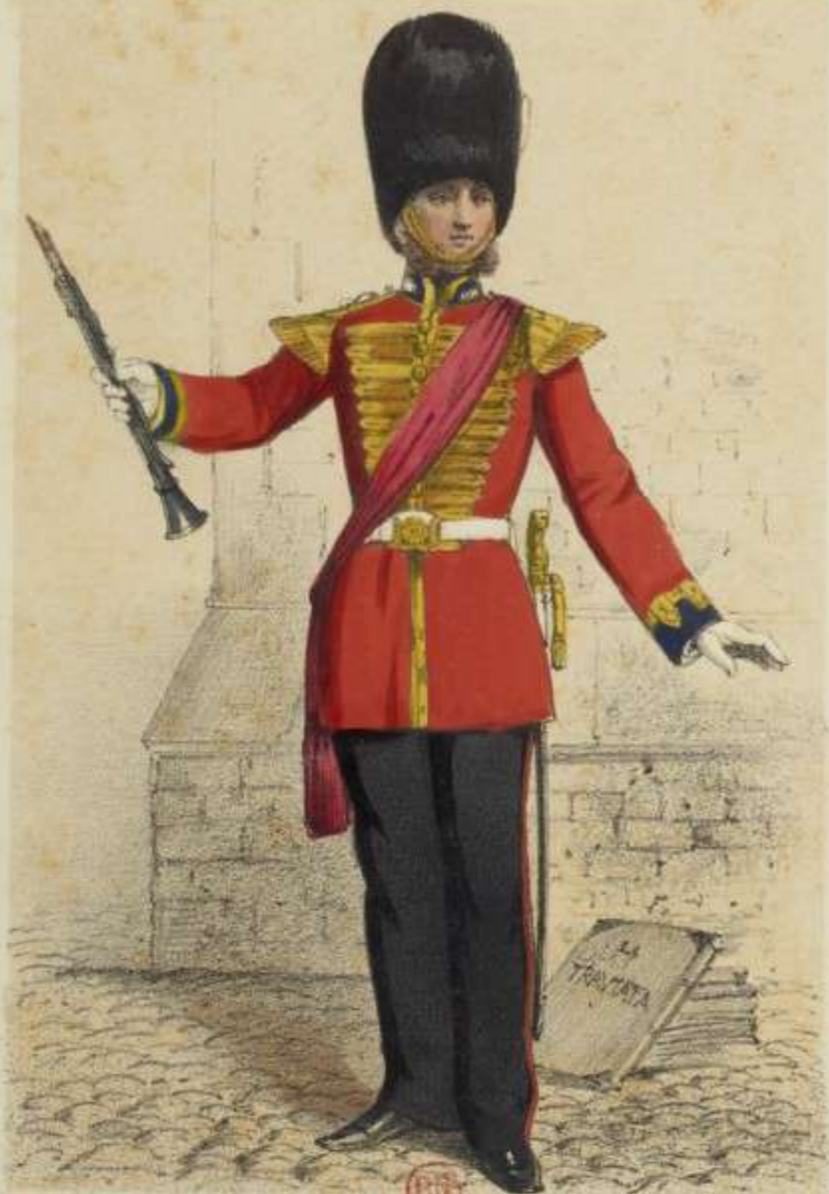
GRENADIER GUARDS. (BAND MASTER.) Clarinet