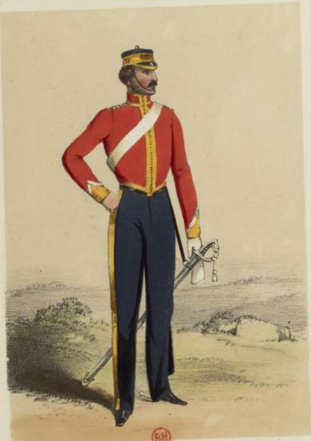
OFFICER 6 th INNISKILLING DRAGOONS (Stable Jacket)