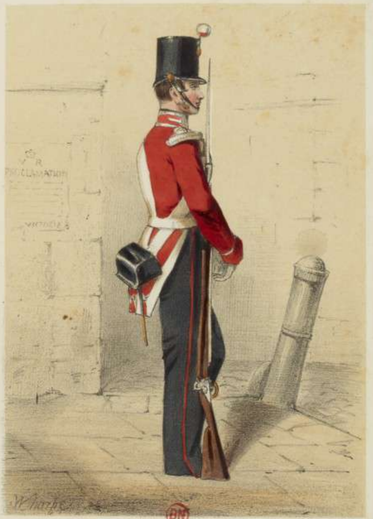
33 rd FOOT. (Duke of Wellington's Own)