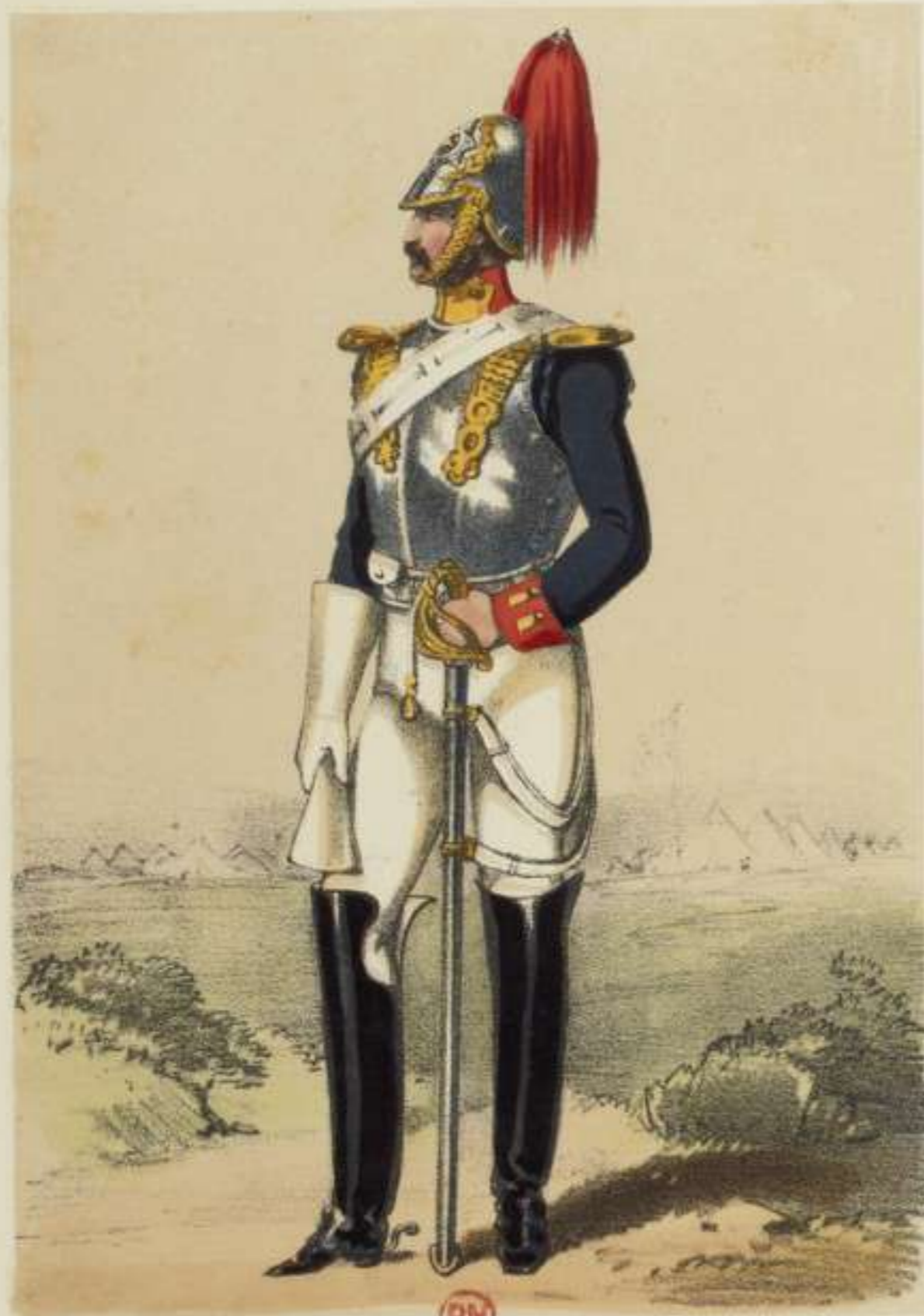
ROYAL HORSE GUARDS.