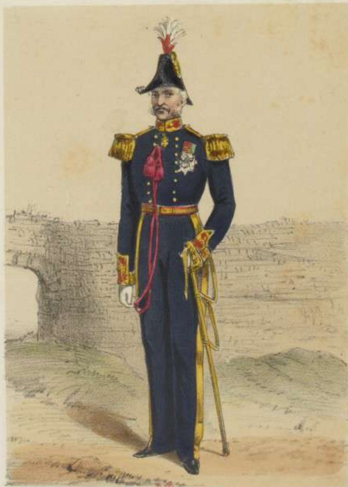
ROYAL ARTILLERY. (Colonel Commandant.)