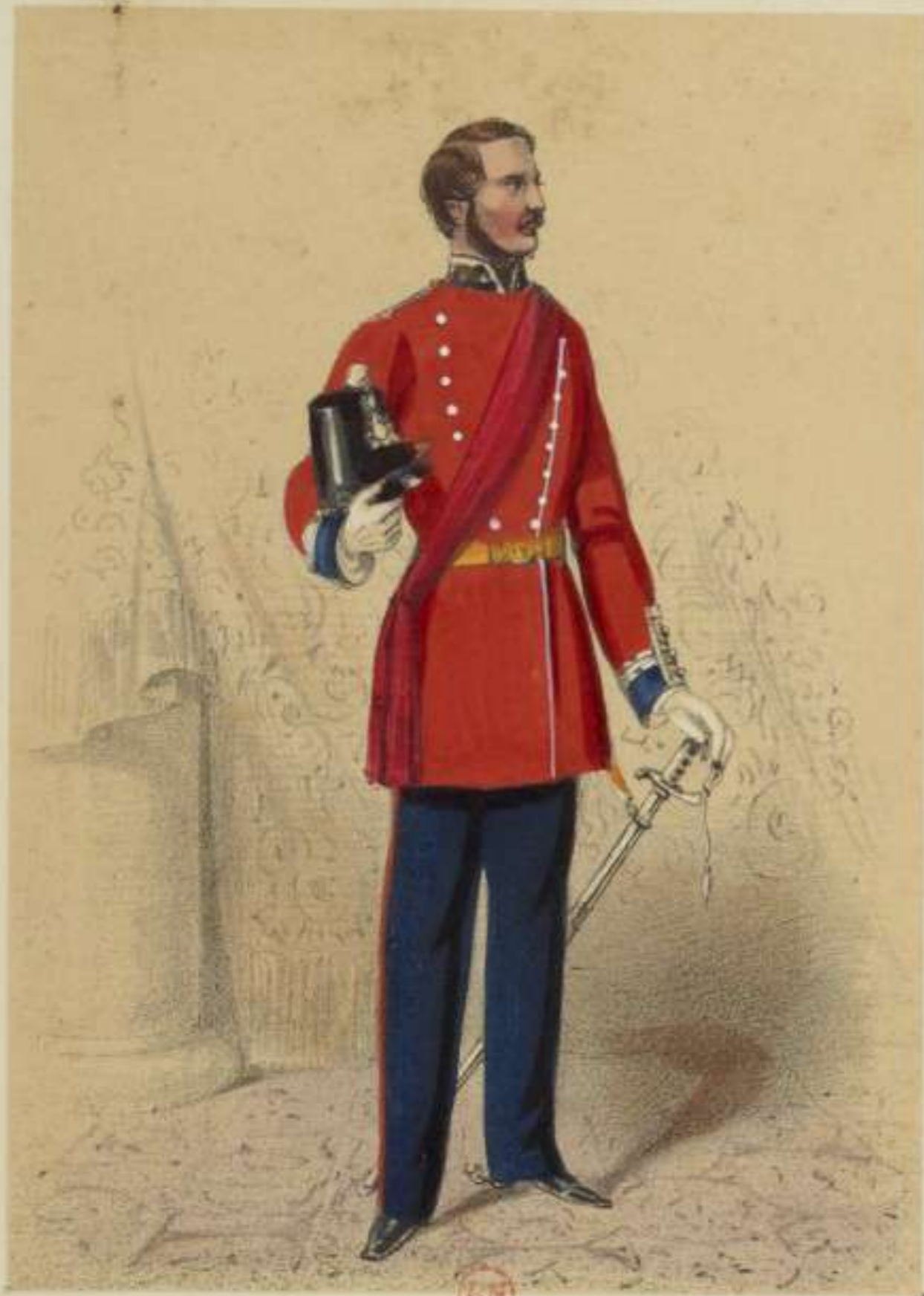
6 TH WEST YORK. - [Major]