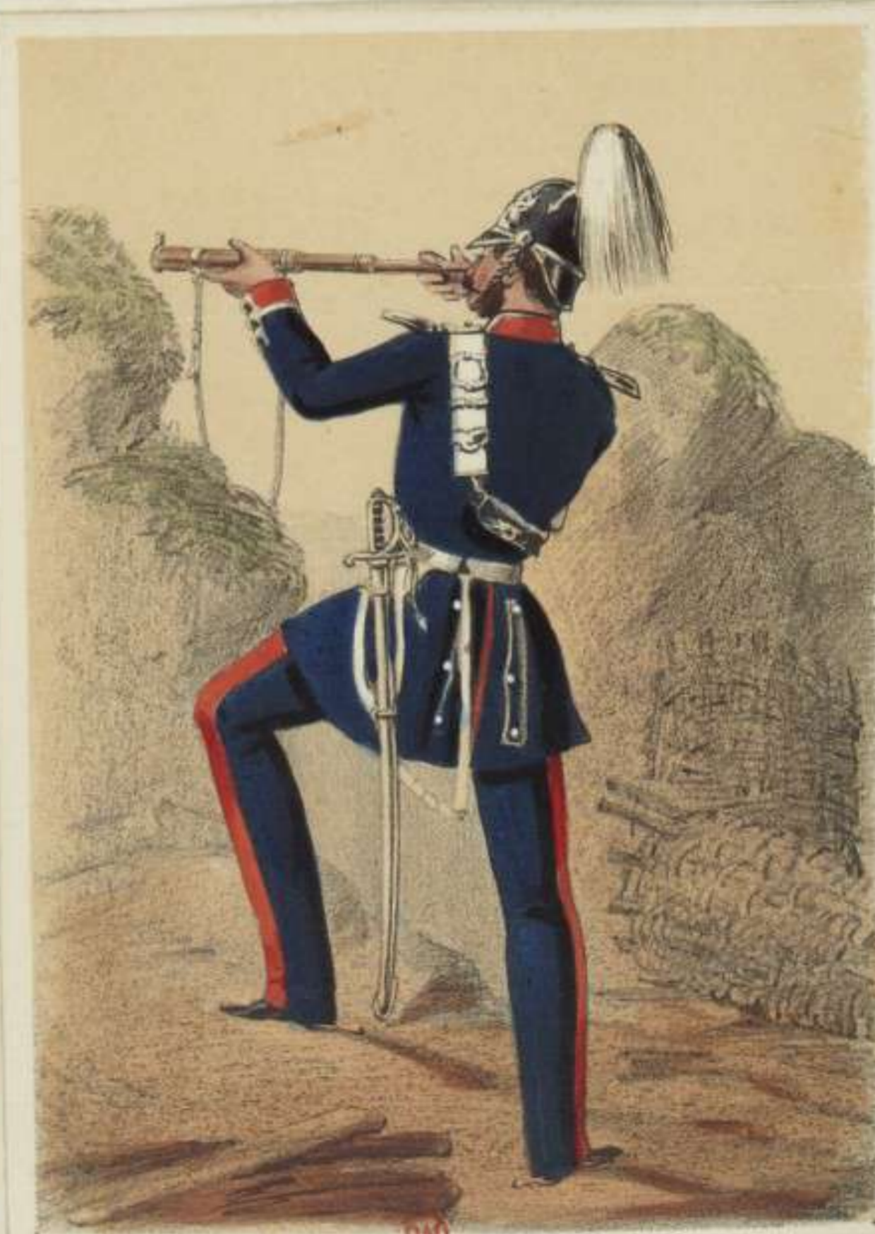
HAMPSHIRE ARTILLERY. (Officer)