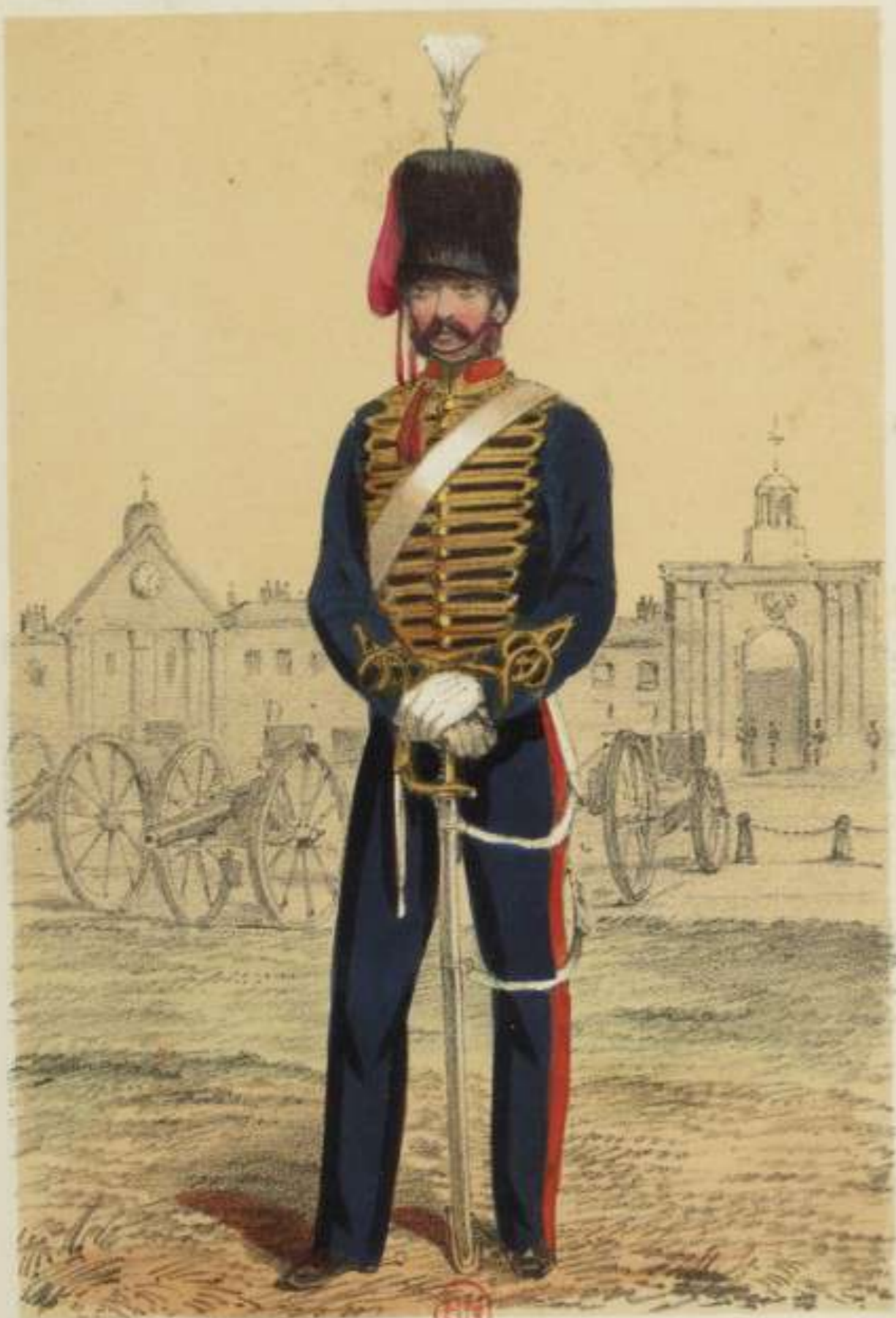
ROYAL HORSE ARTILLERY.