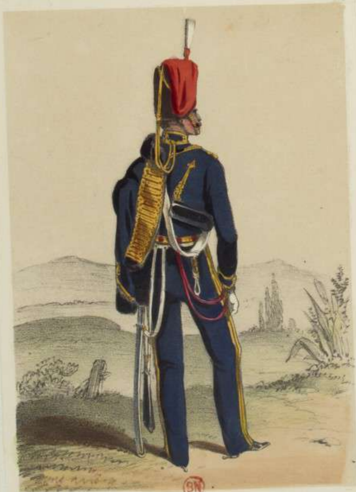
8 th HUSSARS.