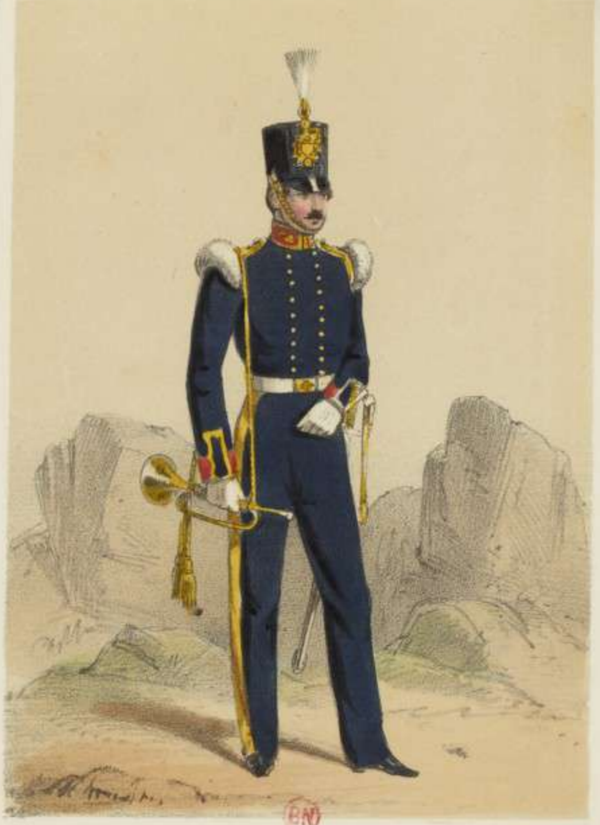
ROYAL ARTILLERY. (Bugler)