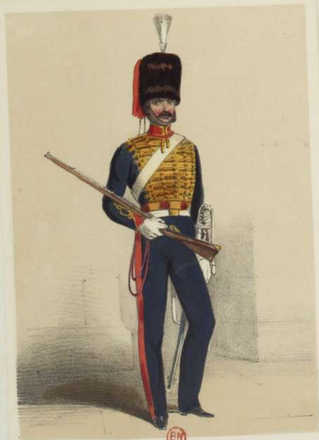
ROYAL HORSE ARTILLERY