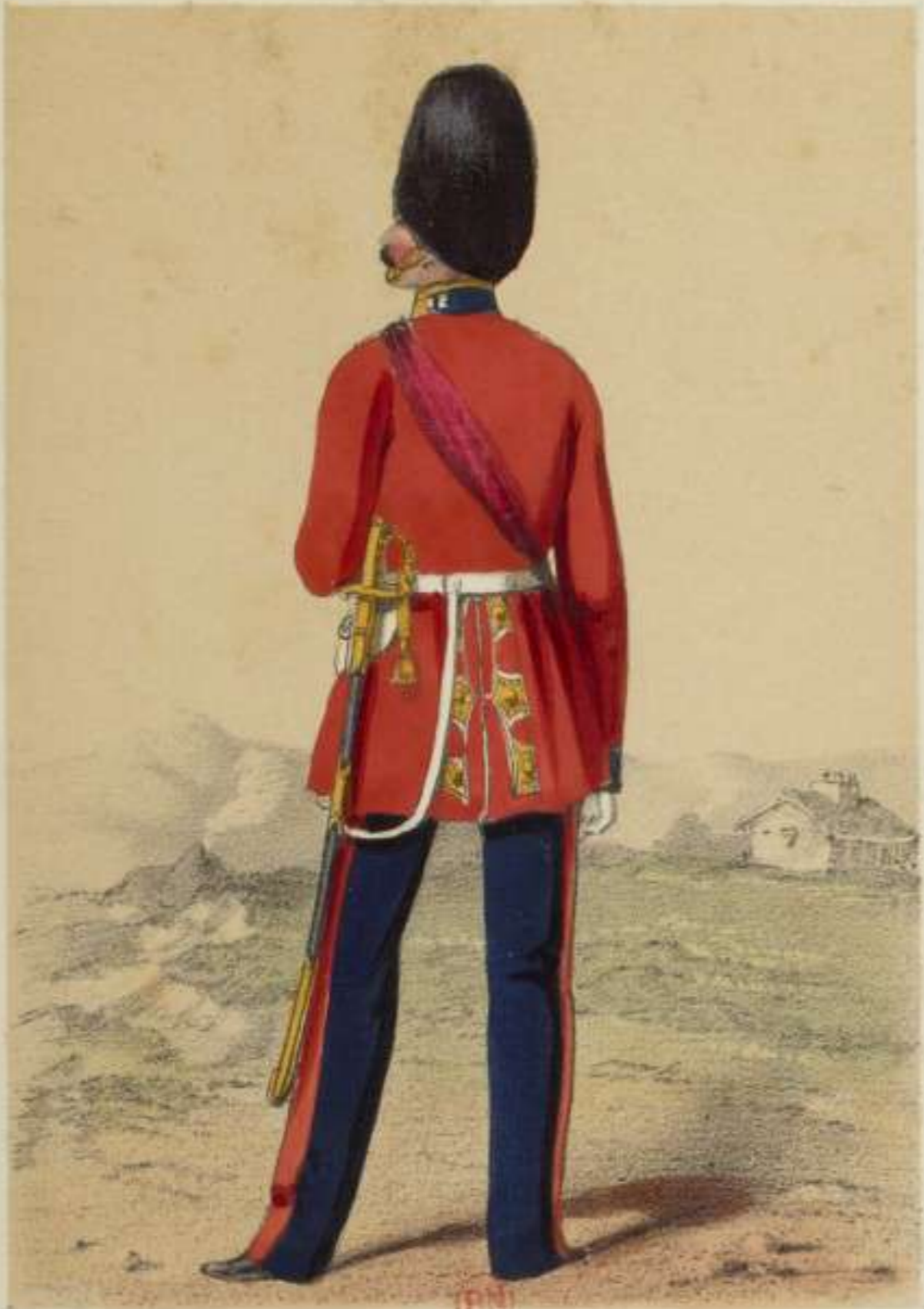
SCOTS FUSILLIER GUARDS. Officer.