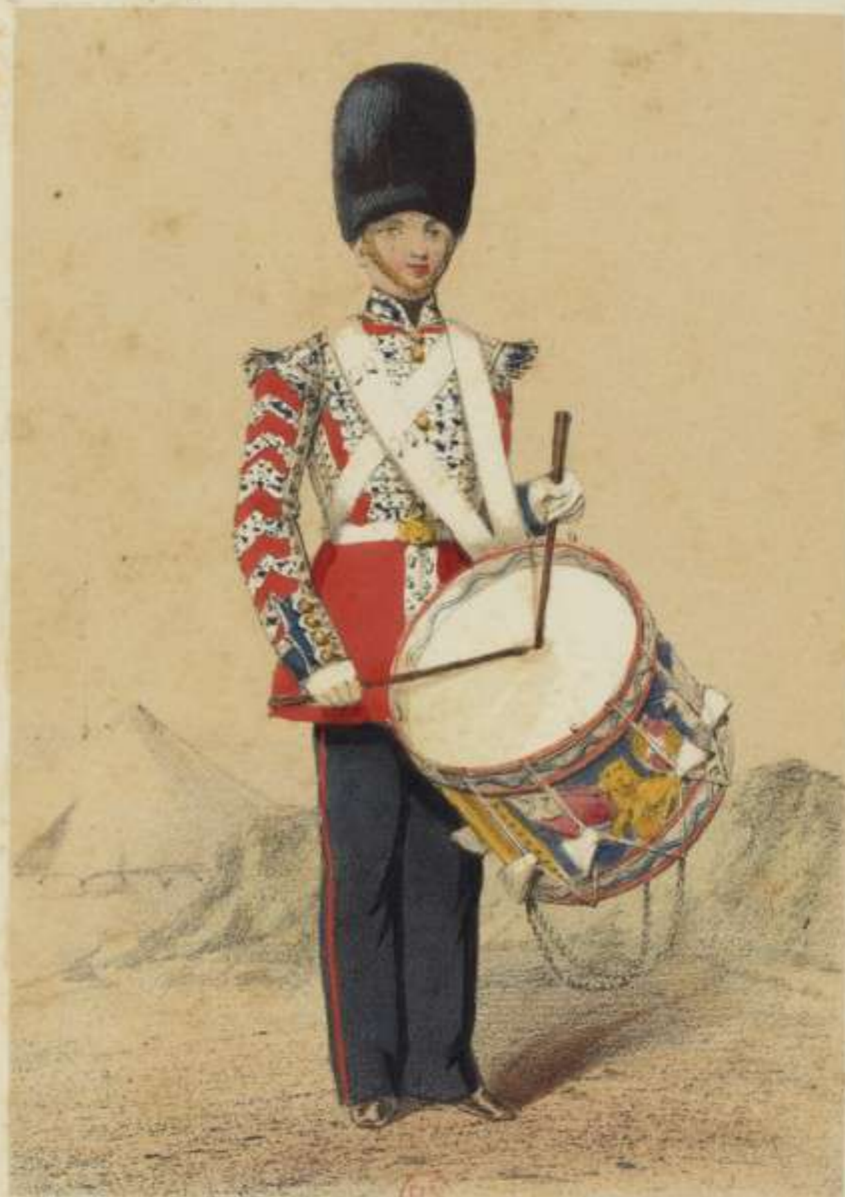
GRENADIER GUARDS. Drummer