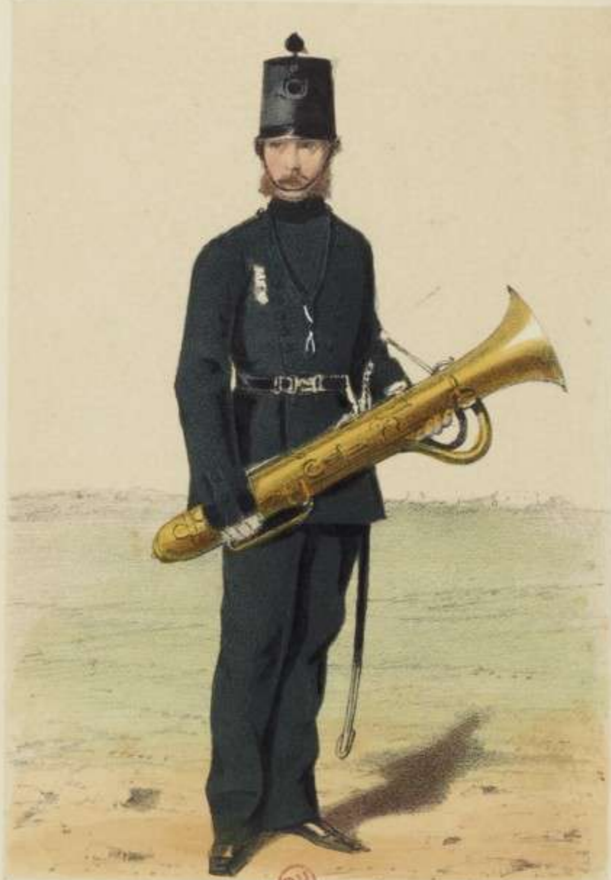
RIFLE BRIGADE. Ophelde