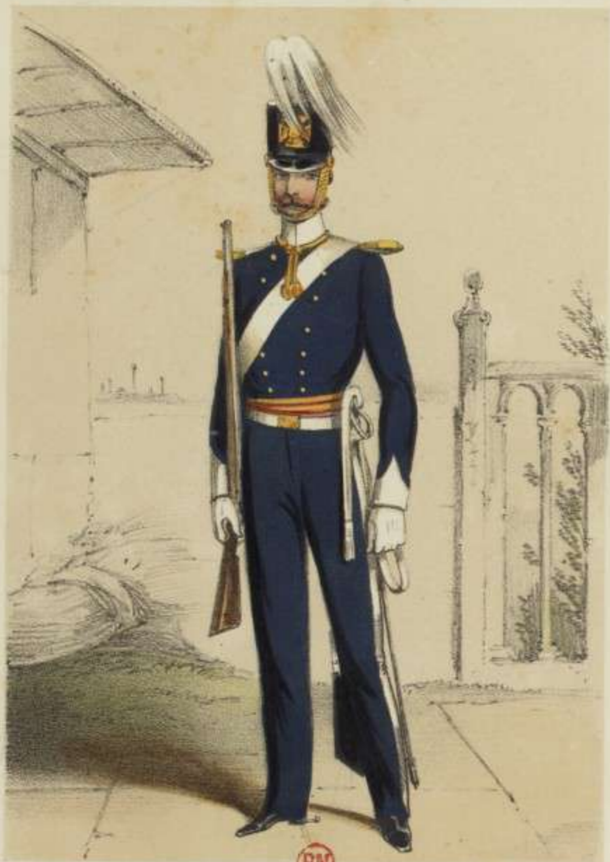
13 th LIGHT DRAGOONS.