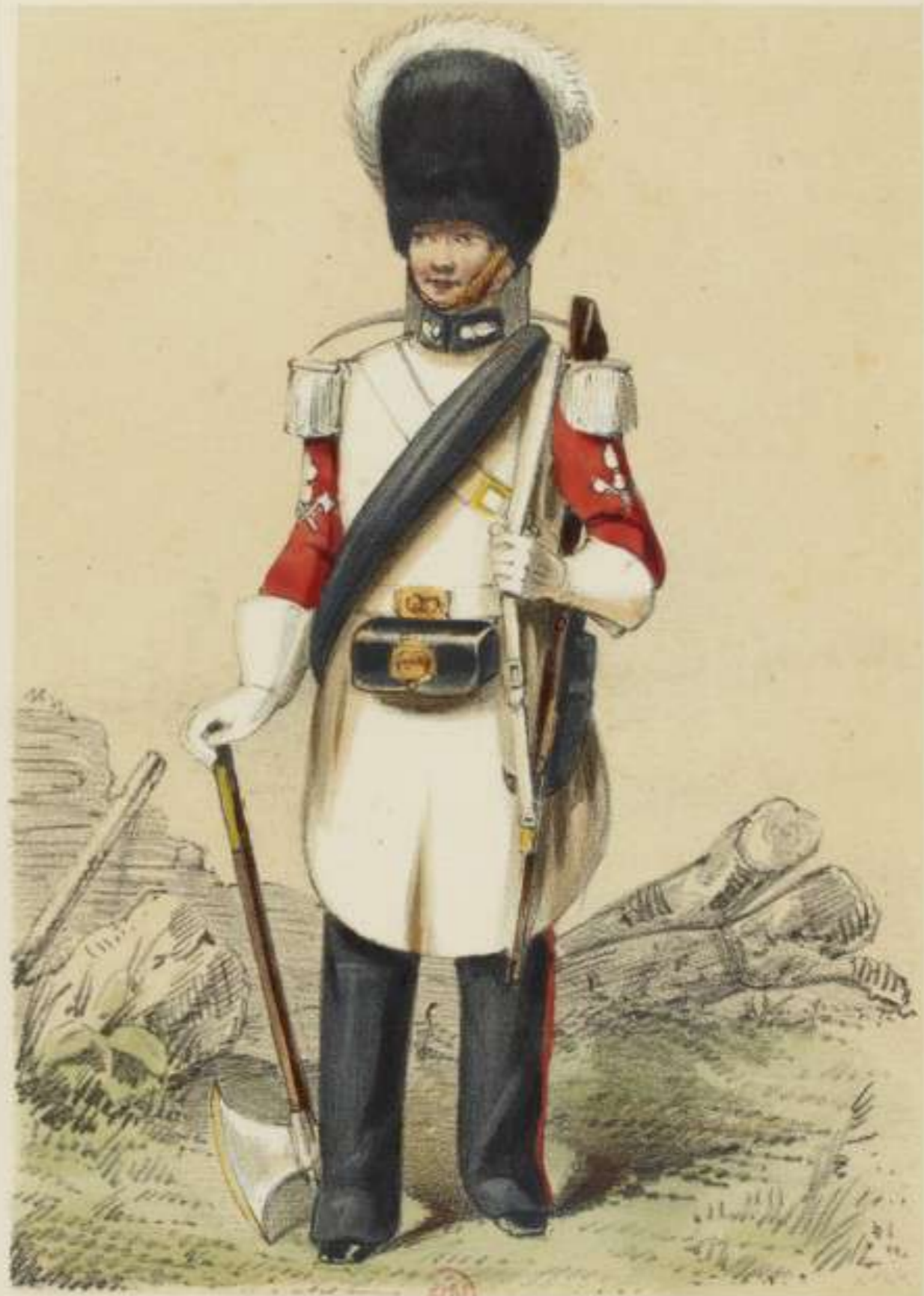
PIONEER. (Grenadier Guards)