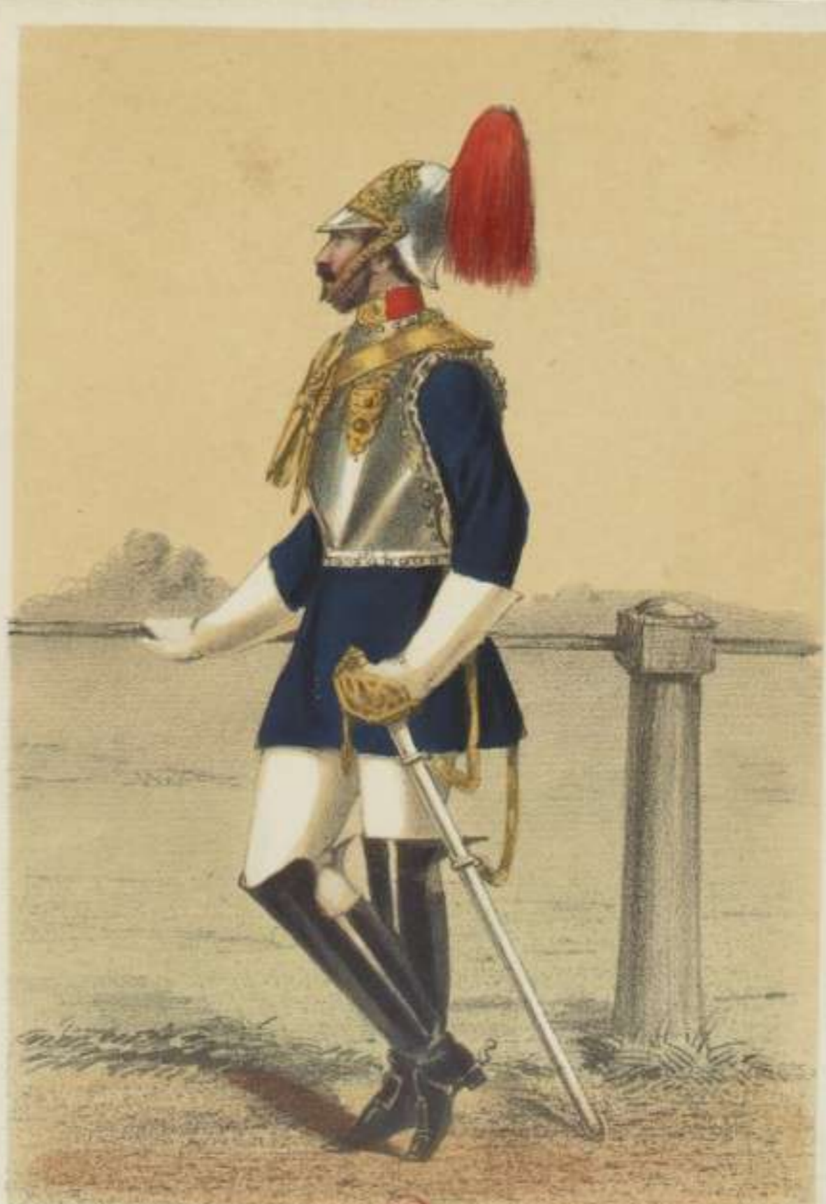
THE ROYAL HORSE GUARDS. (OFFICER.)