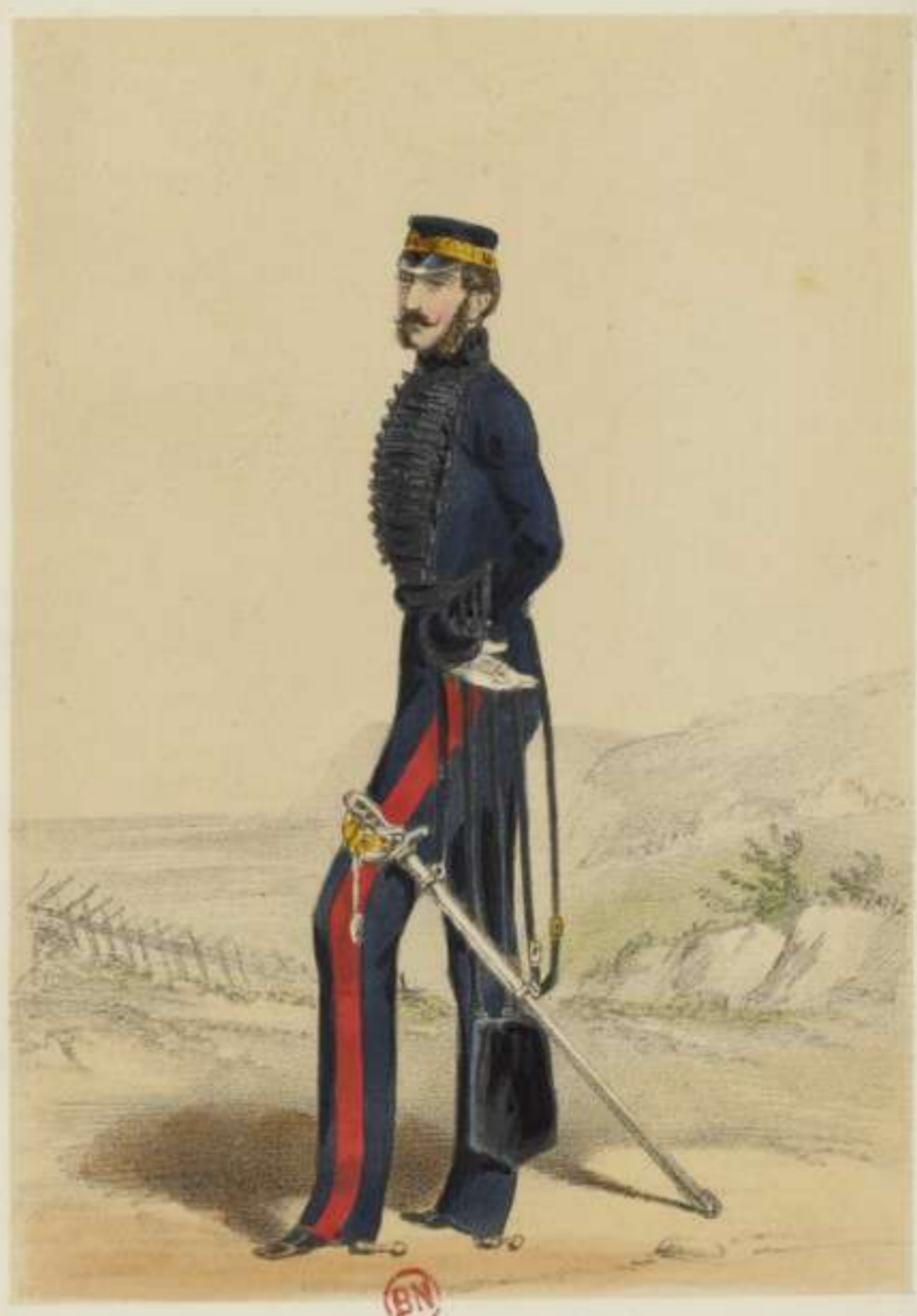
ROYAL HORSE ARTILLERY. (Officer Uniform)