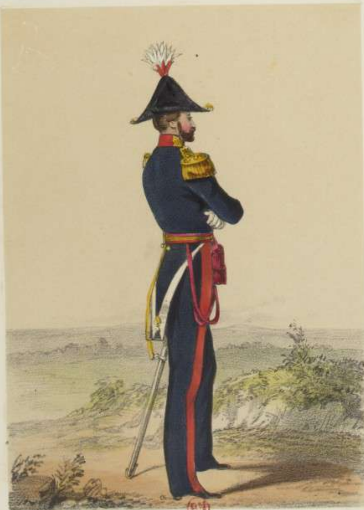
OFFICER OF ORDNANCE STAFF.