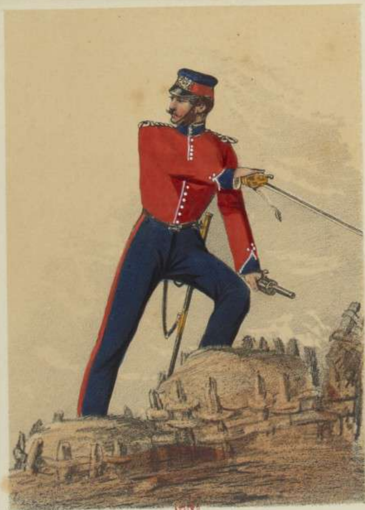
ROYAL EAST MIDDLESEX. (Officer in Shell Jacket)