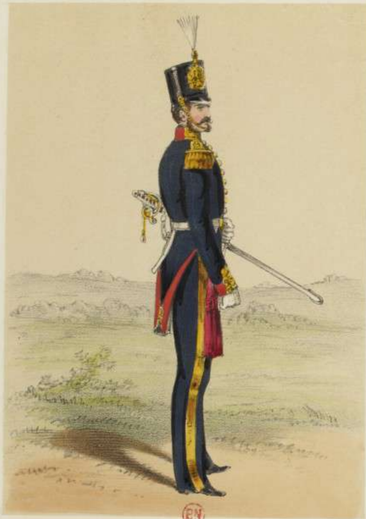
ROYAL ARTILLERY. (Officer)