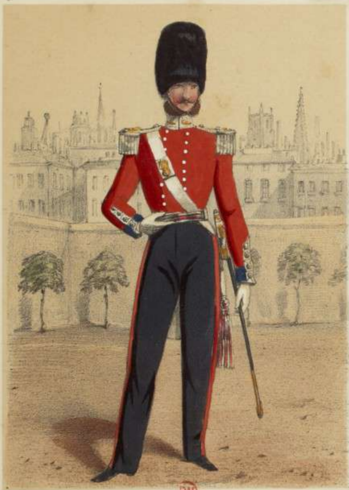
THE HON. ARTILLERY COMPANY OF LONDON. (Officer)