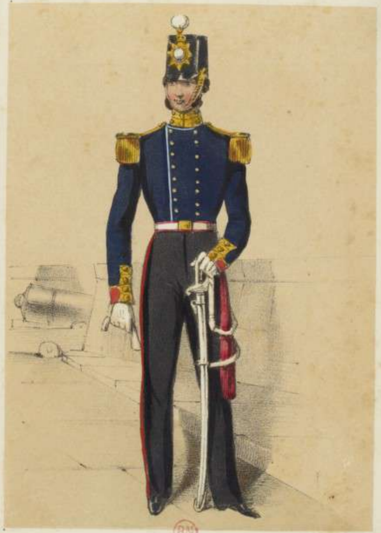
ROYAL MARINE ARTILLERY. (Officer)