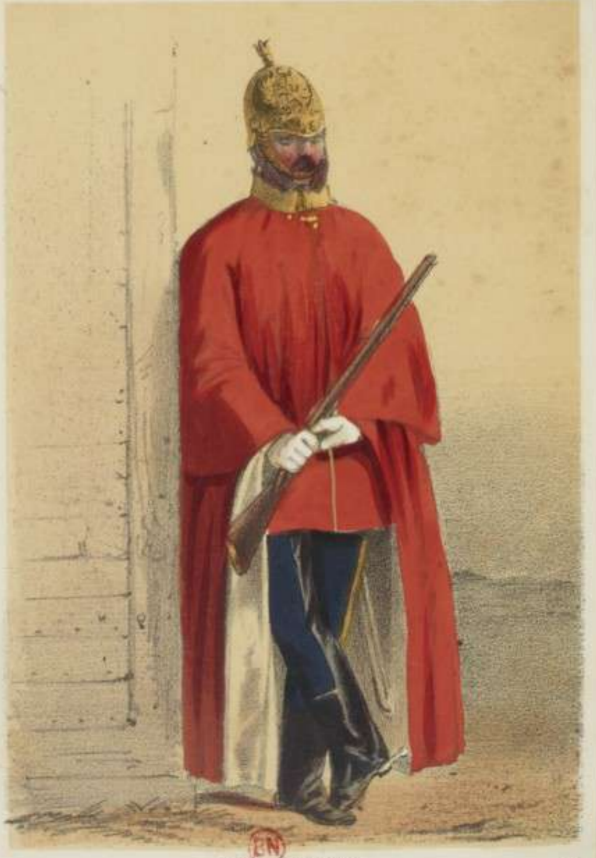
6 TH DRAGOONS.