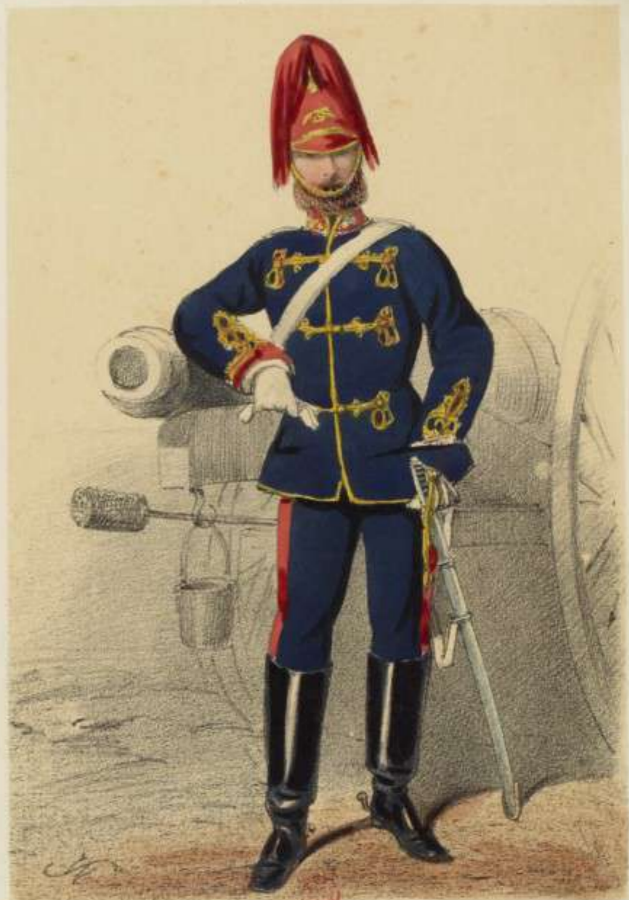
ARTILLERY TURKISH CONTINGENT Captain