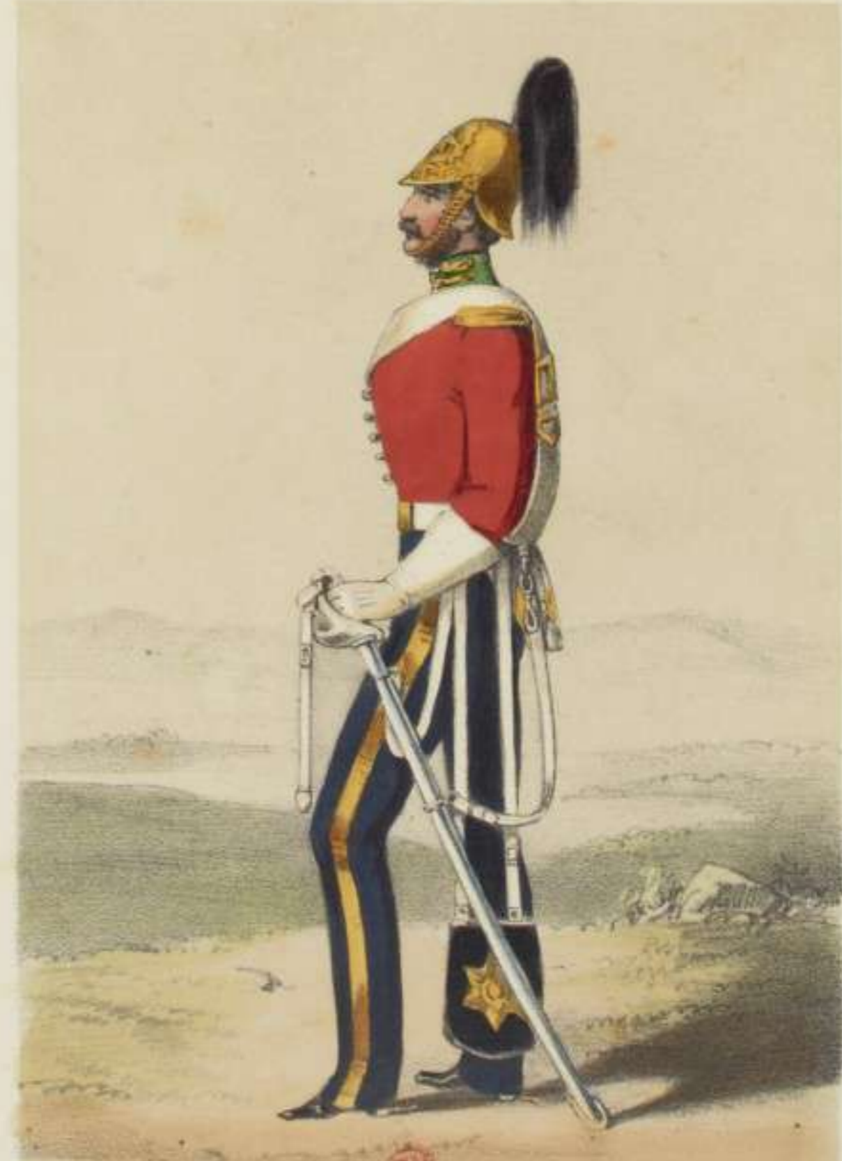
5 TH DRAGOON GUARDS.