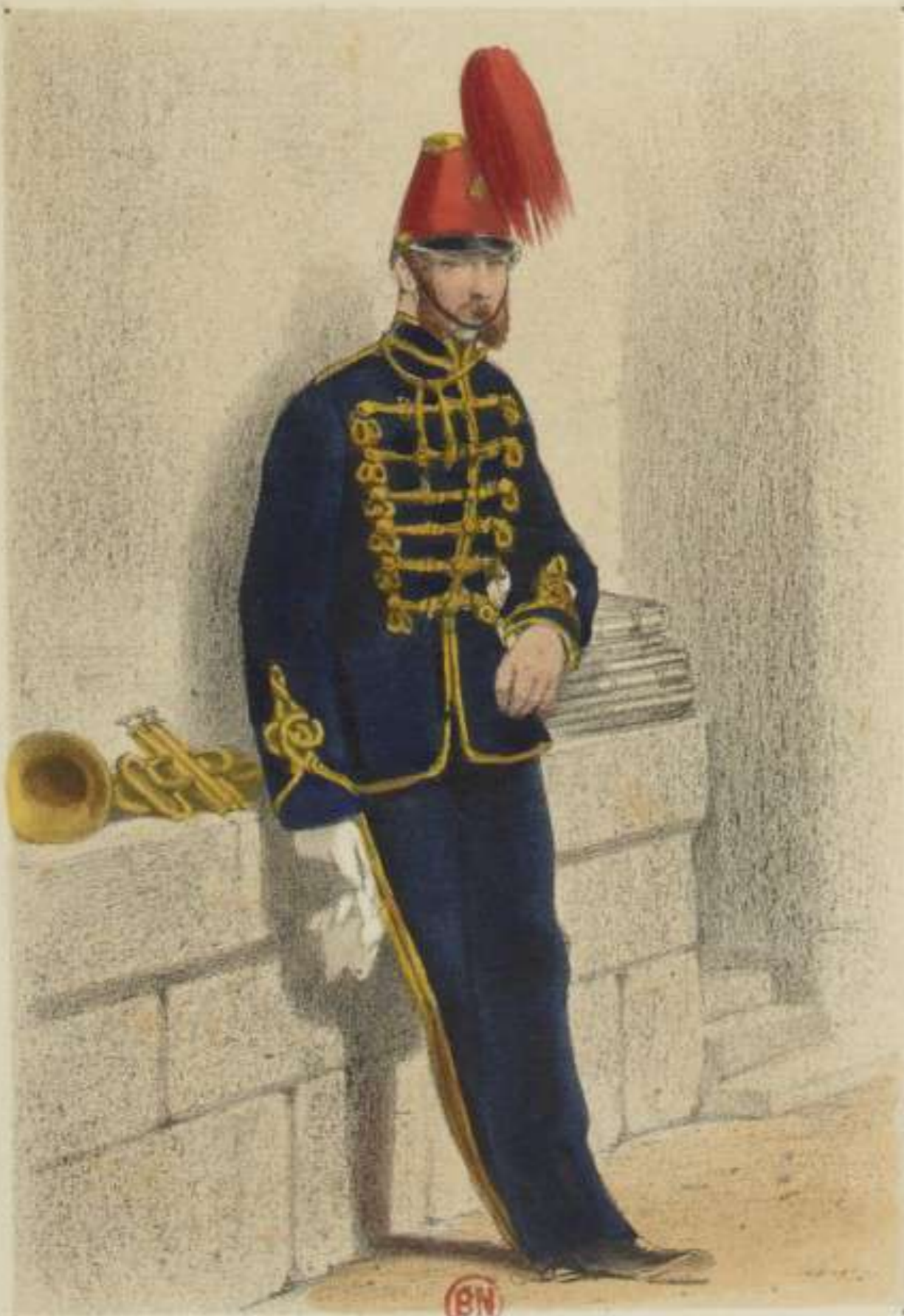
15 th HUSSARS. Cornet.