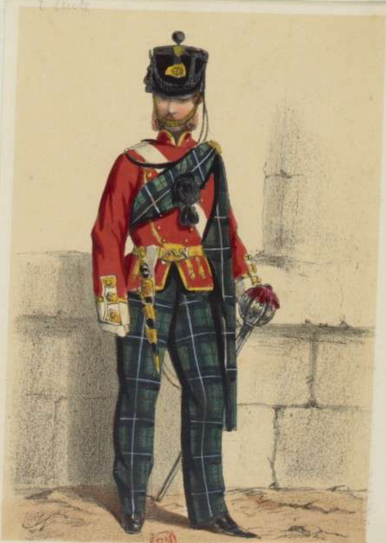
71 ST HIGHLAND L' INFRANTRY Officer.