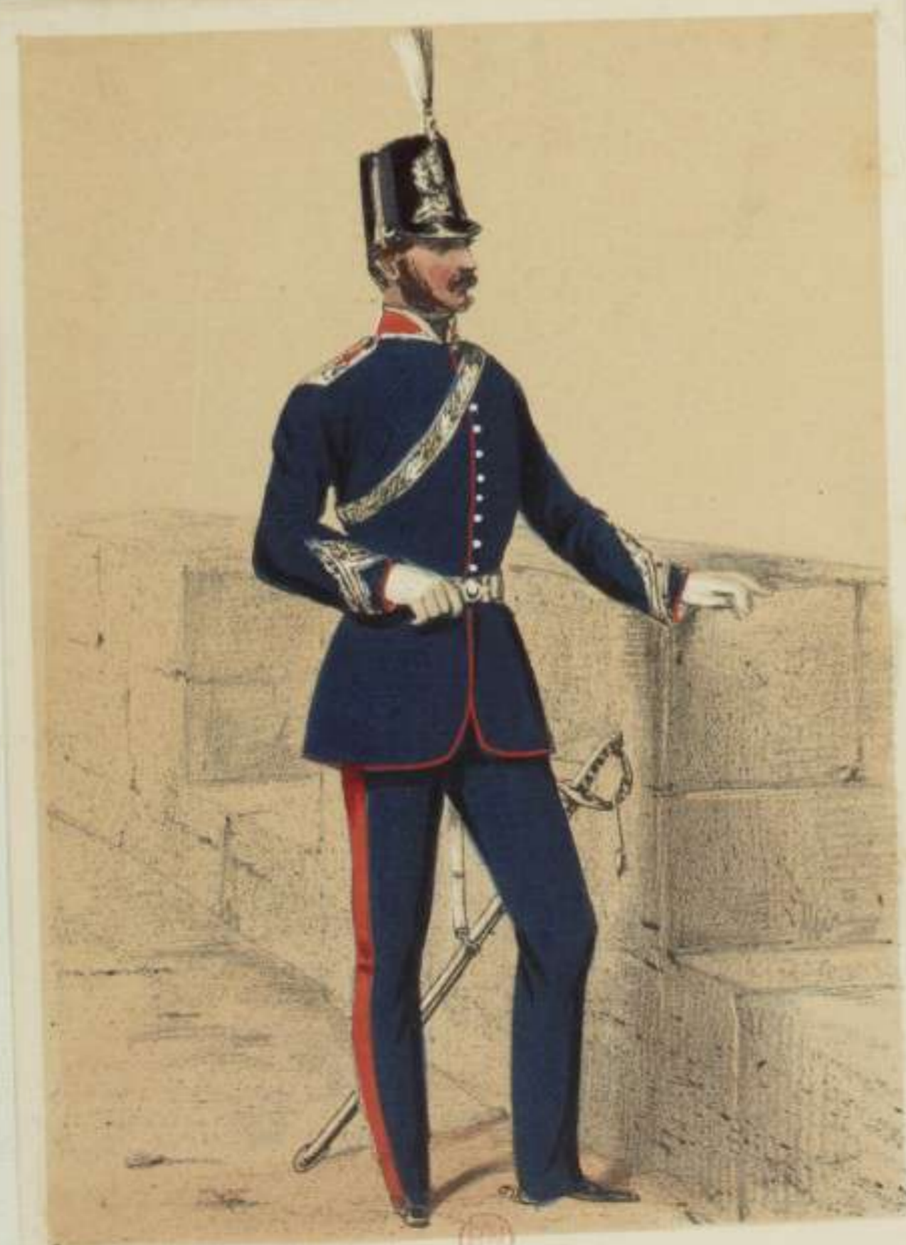
ROYAL ARTILLERY. (Officer)