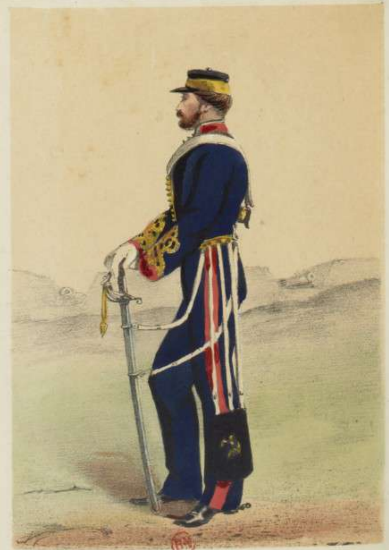
ROYAL ARTILLERY. Capt o & Adjutant.