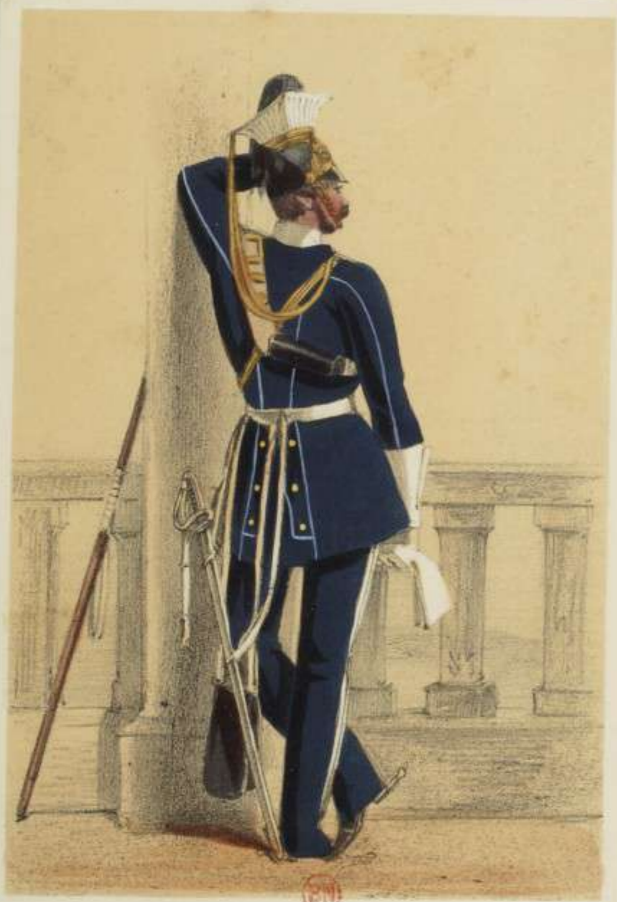
17 th LANGERS.