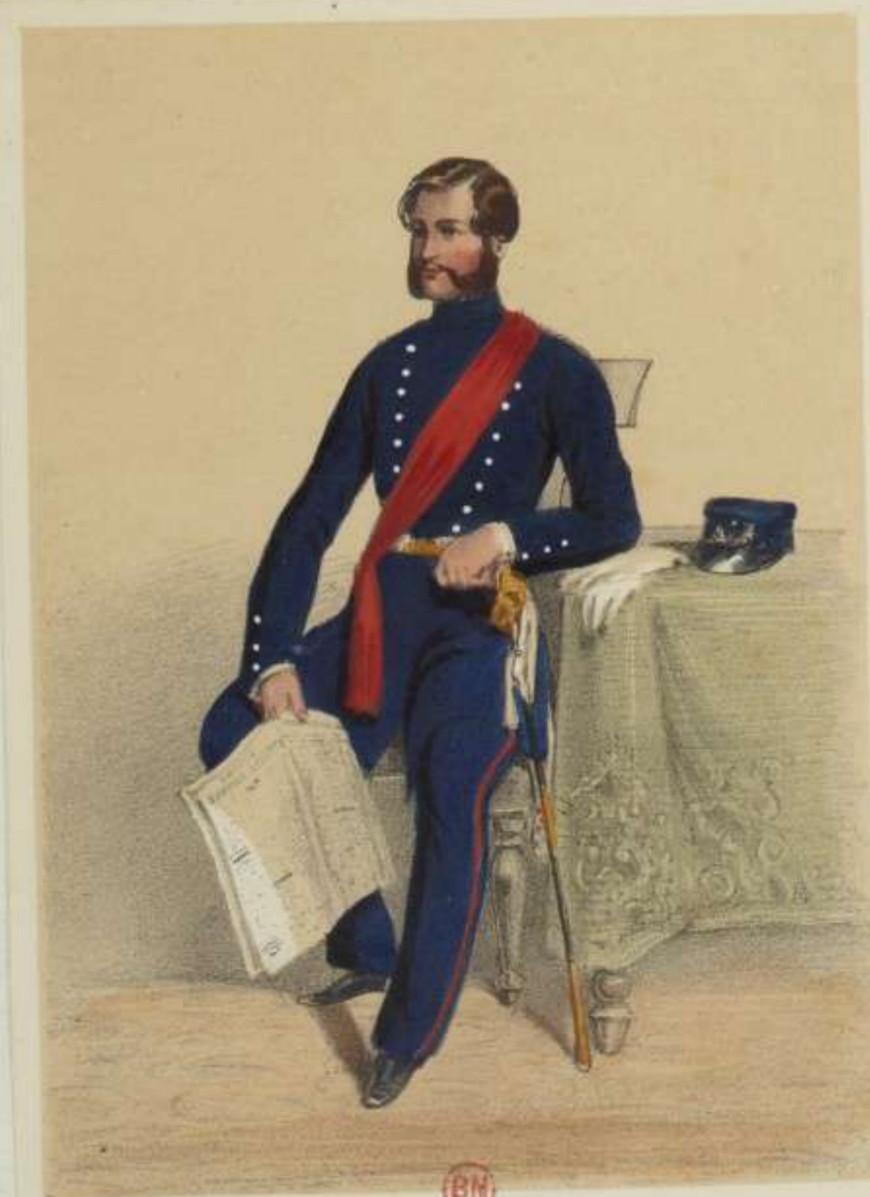
2ND SOMERSET. (Officer Undress)