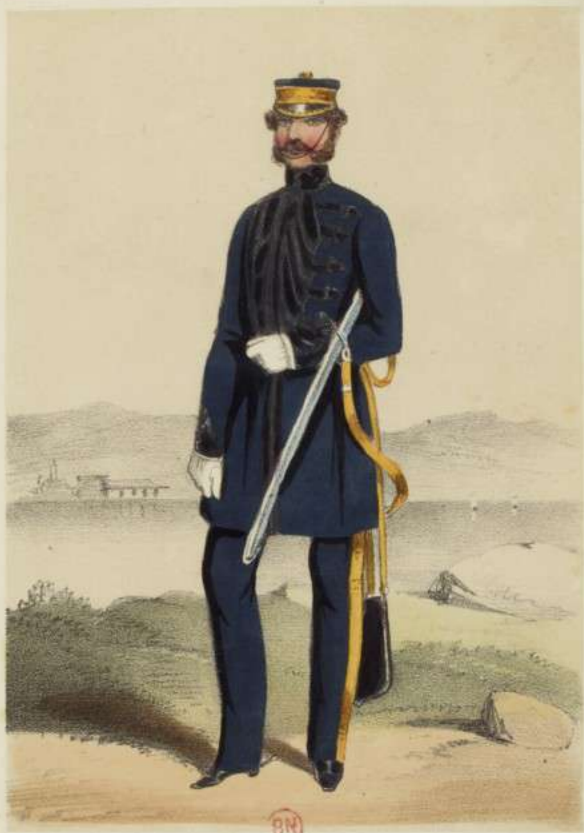
DRAGOON OFFICER. (Undress)