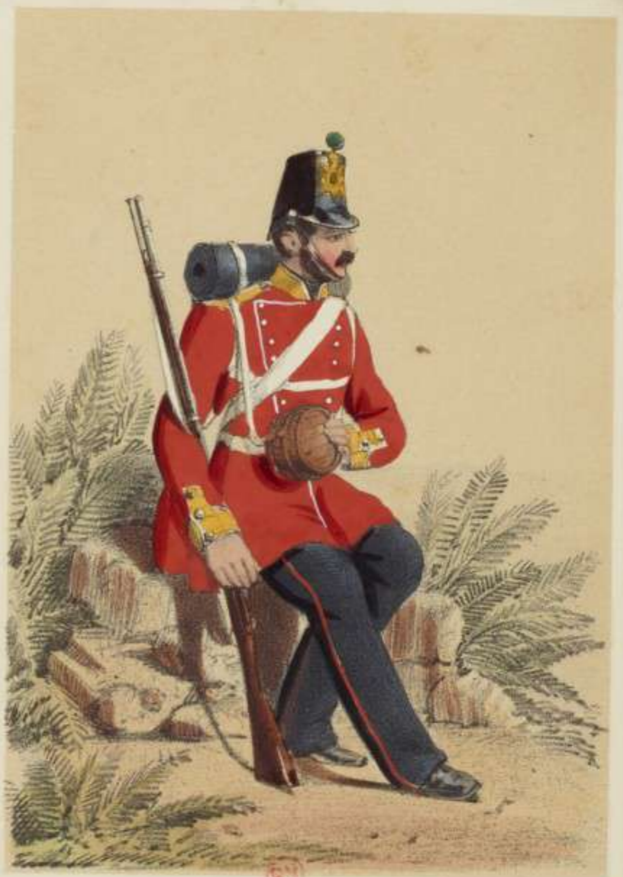
PRIVATE OF THE LINE. Heavy Marching Order