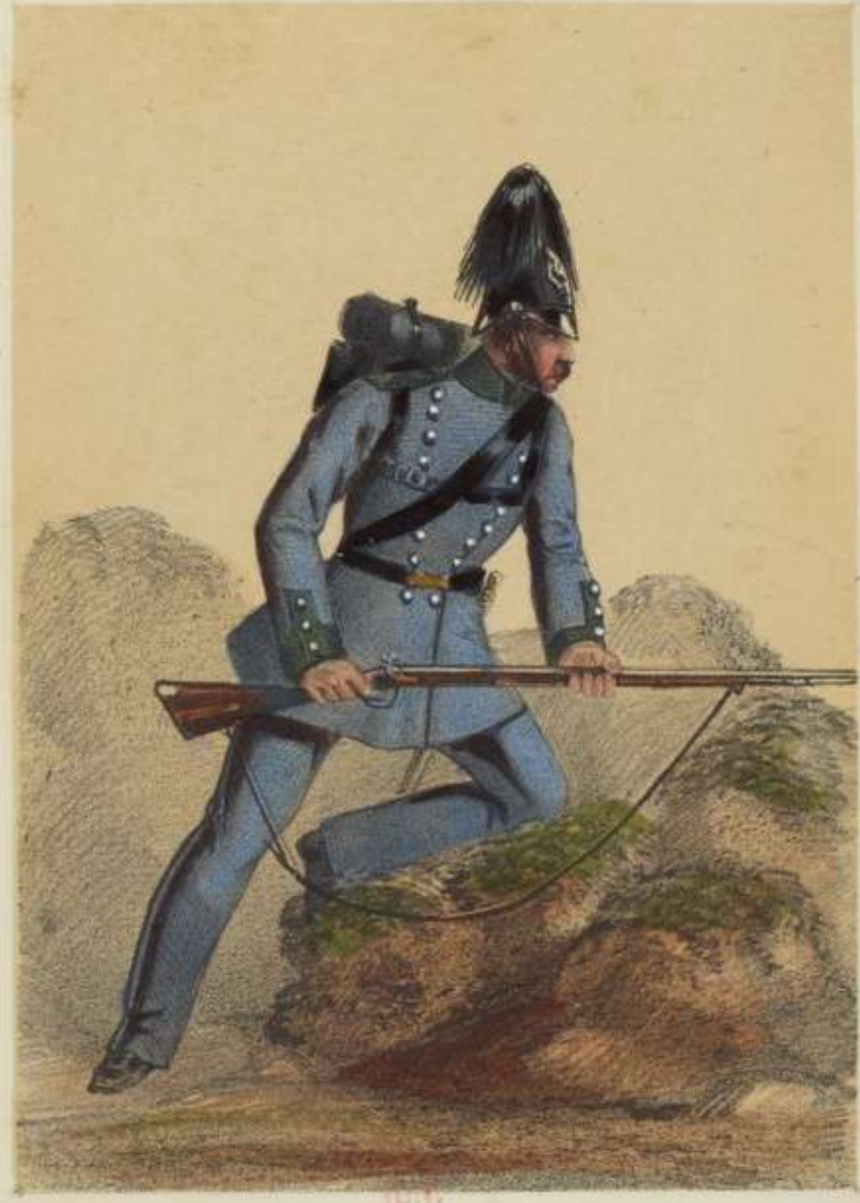
ESSEX RIFLES. [Private]