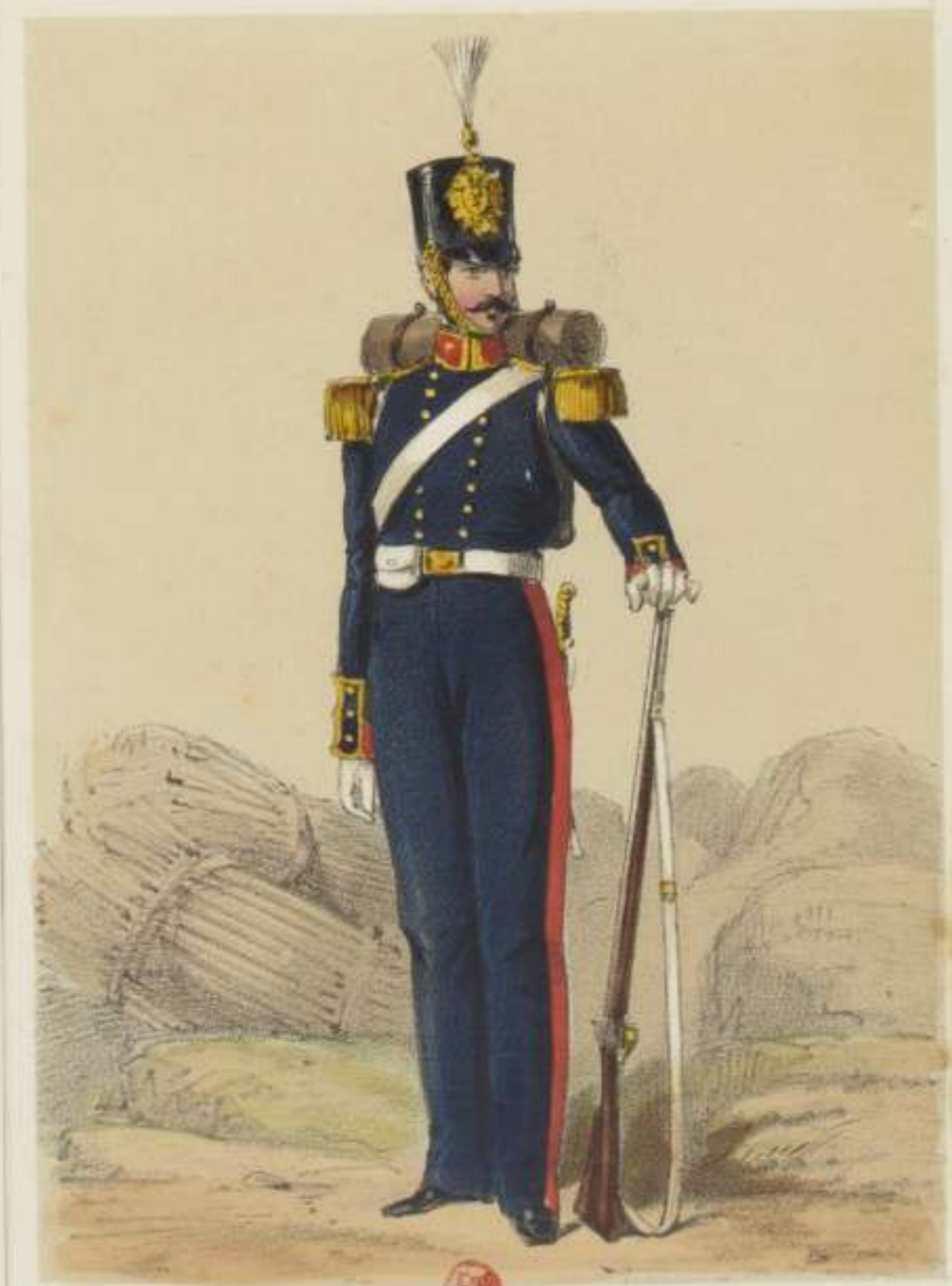
ROYAL ARTILLERY. (Private)