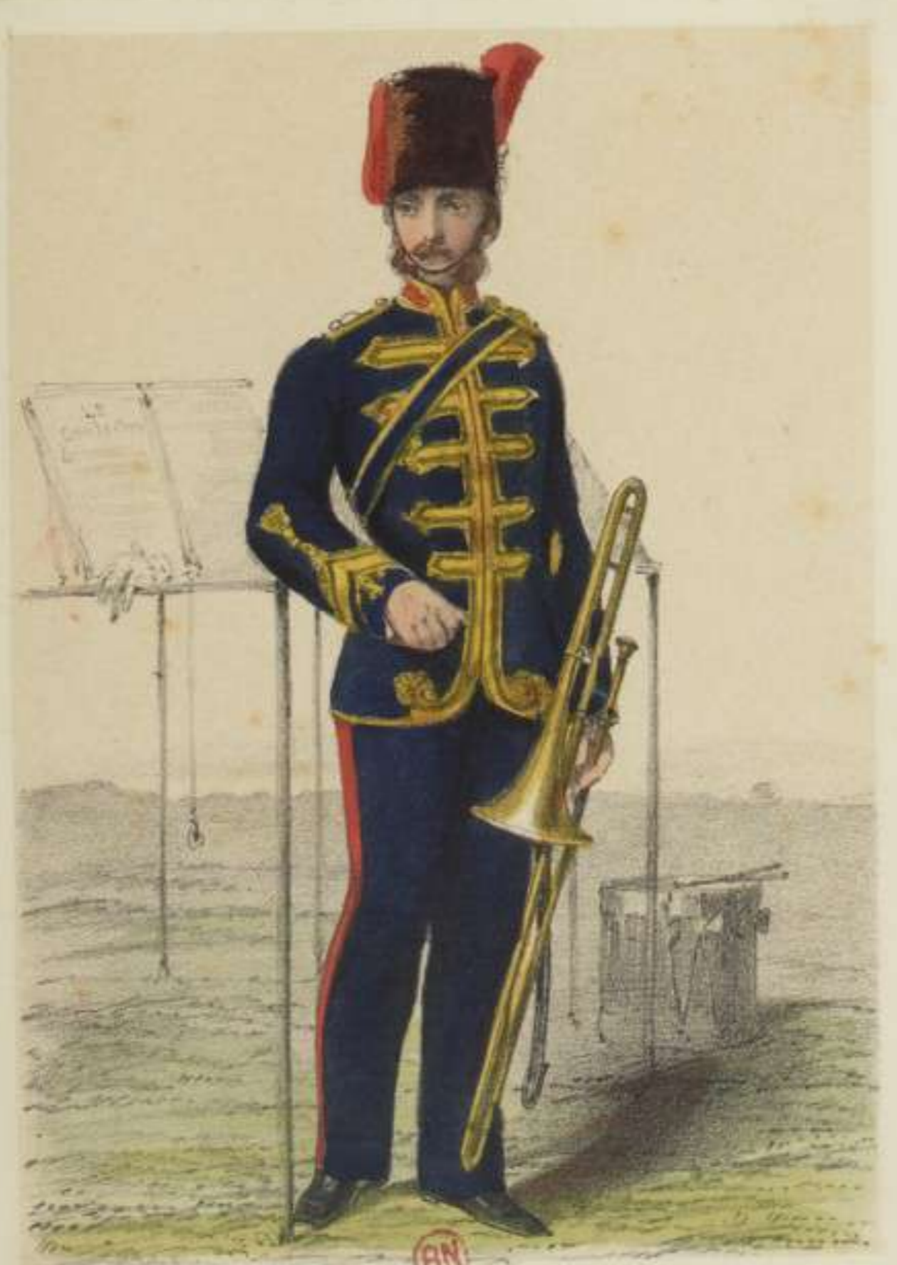
ROYAL ARTILLERY. Trombone