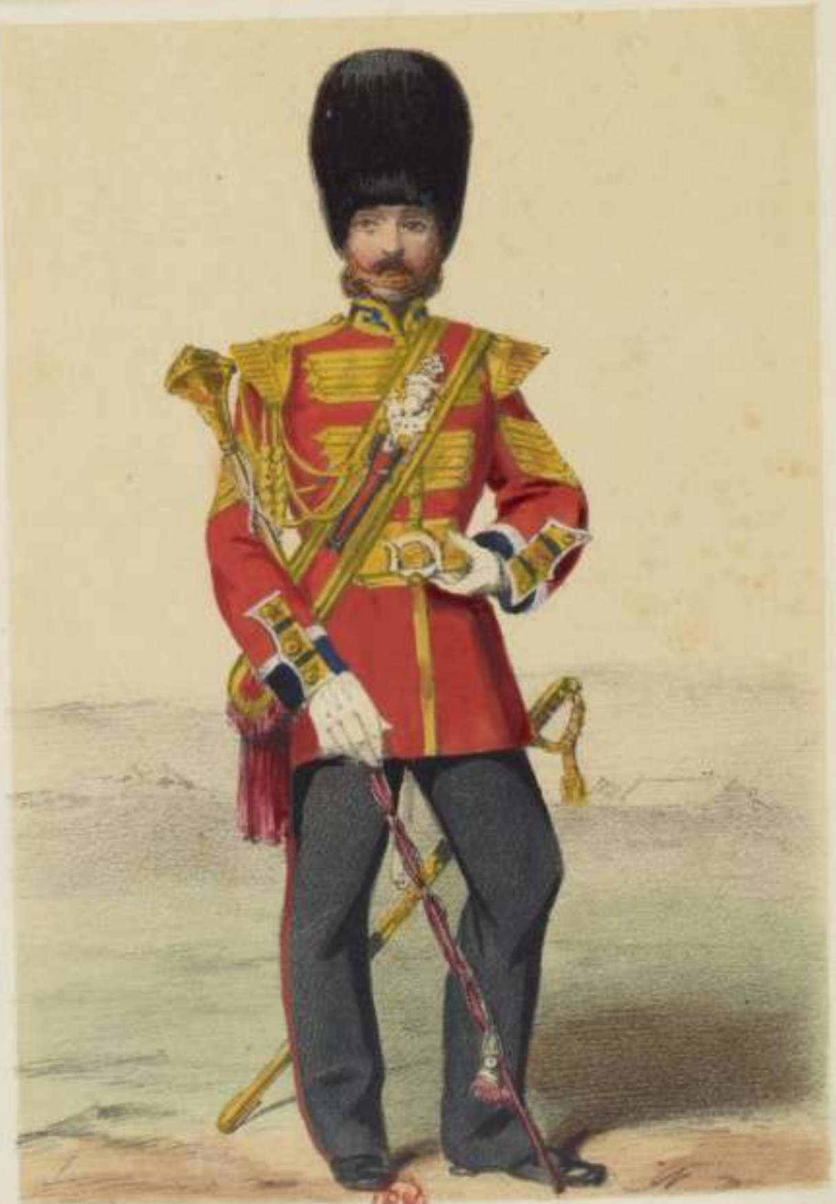
SCOTS FUSILIER GUARDS. Drum Major