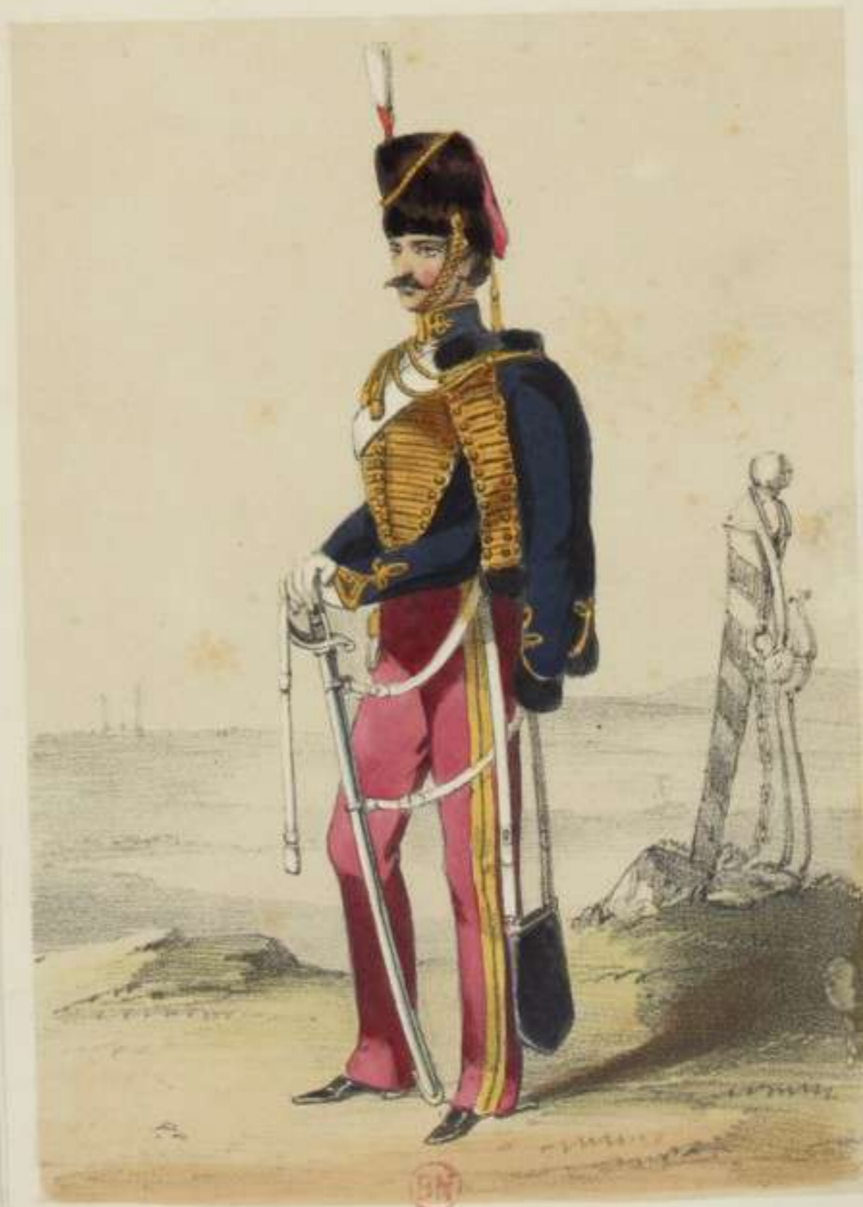
11 th HUSSARS.