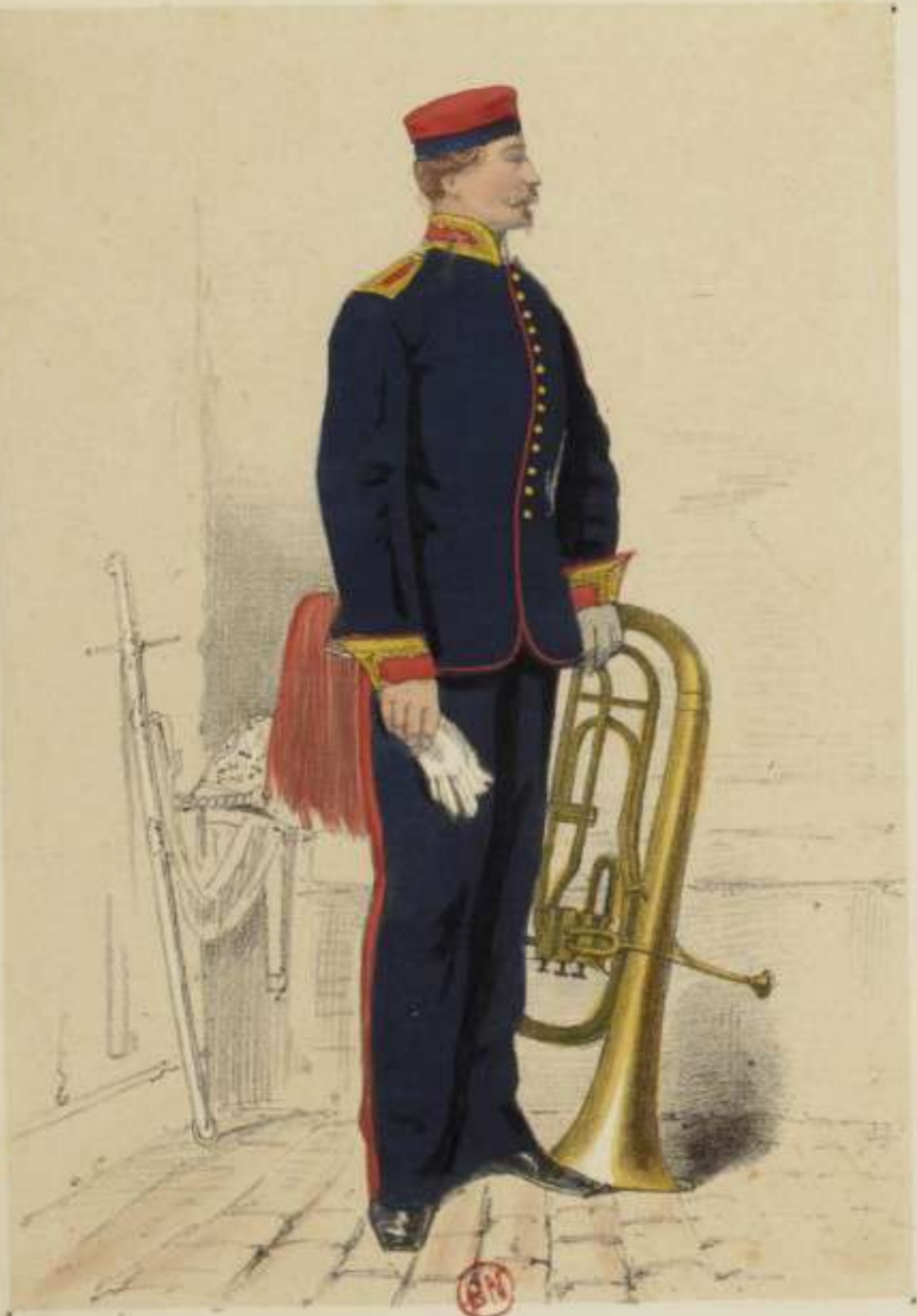
ROYAL HORSE GUARDS. Contrabass.