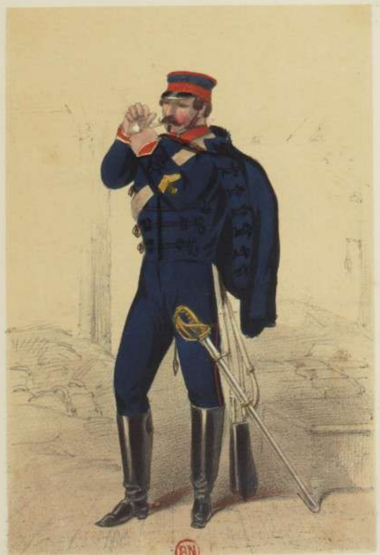
LAND TRANSPORT CORPS.