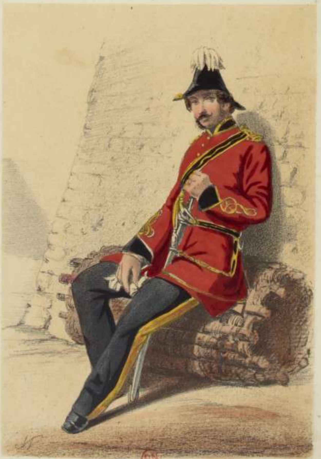
ROYAL ENGINEERS Lieutenant