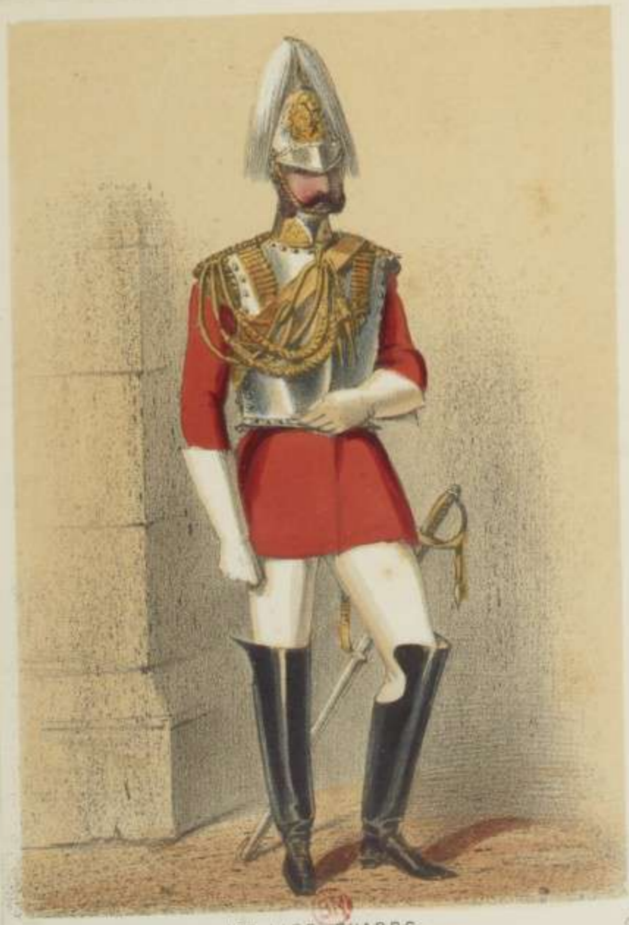
1ST LIFE GUARDS. (Officer)