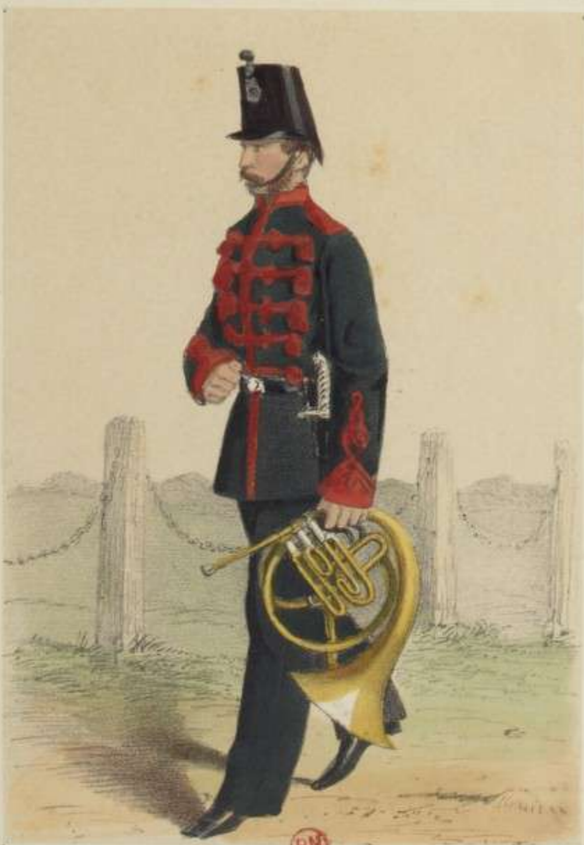
60 TH RIFLES. French Horn