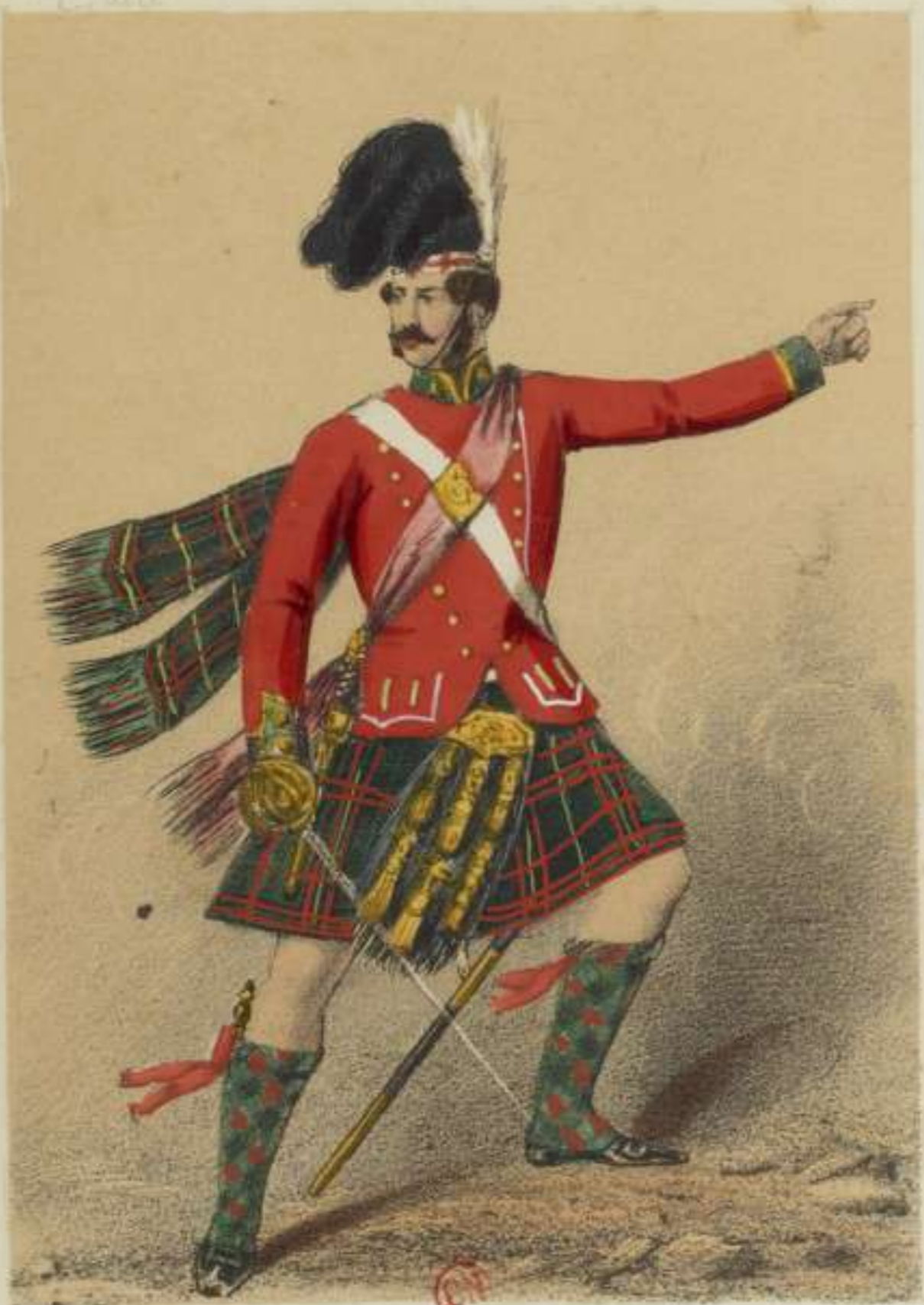
79 th HIGHLANDERS. Officer