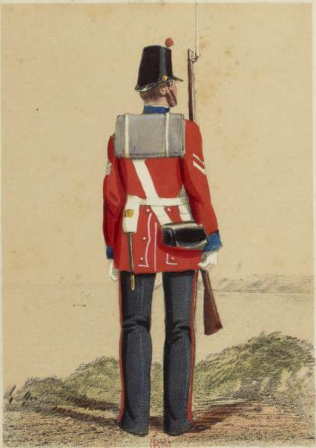
CORPORAL OF THE LINE. Field Order