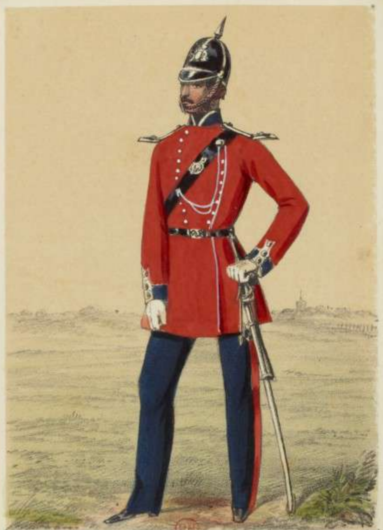
SOUTH MIDDLESEX. (Officer)