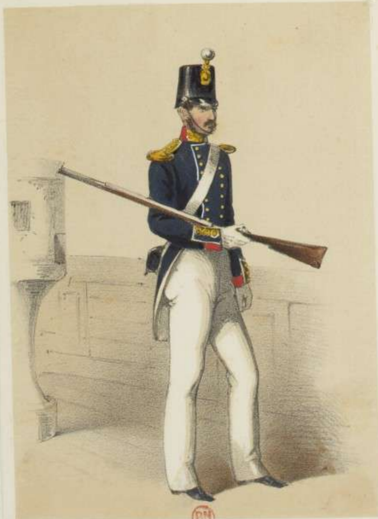
ROYAL MARINE ARTILLERY (Private)