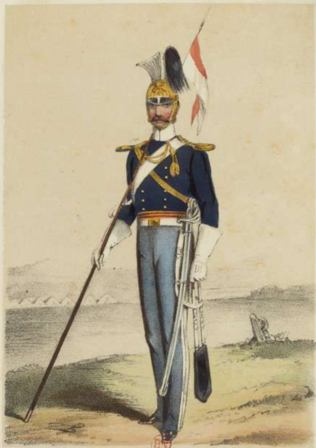
17 th LANCERS.