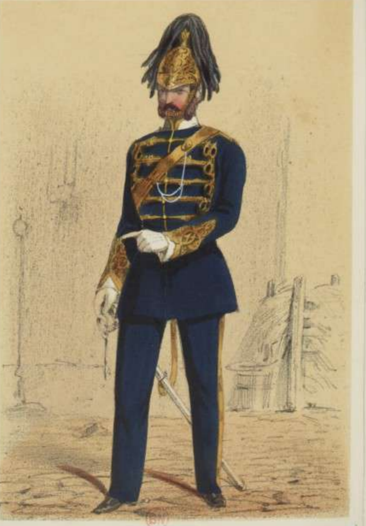
6TH DRAGOON GUARDS. (Officer)