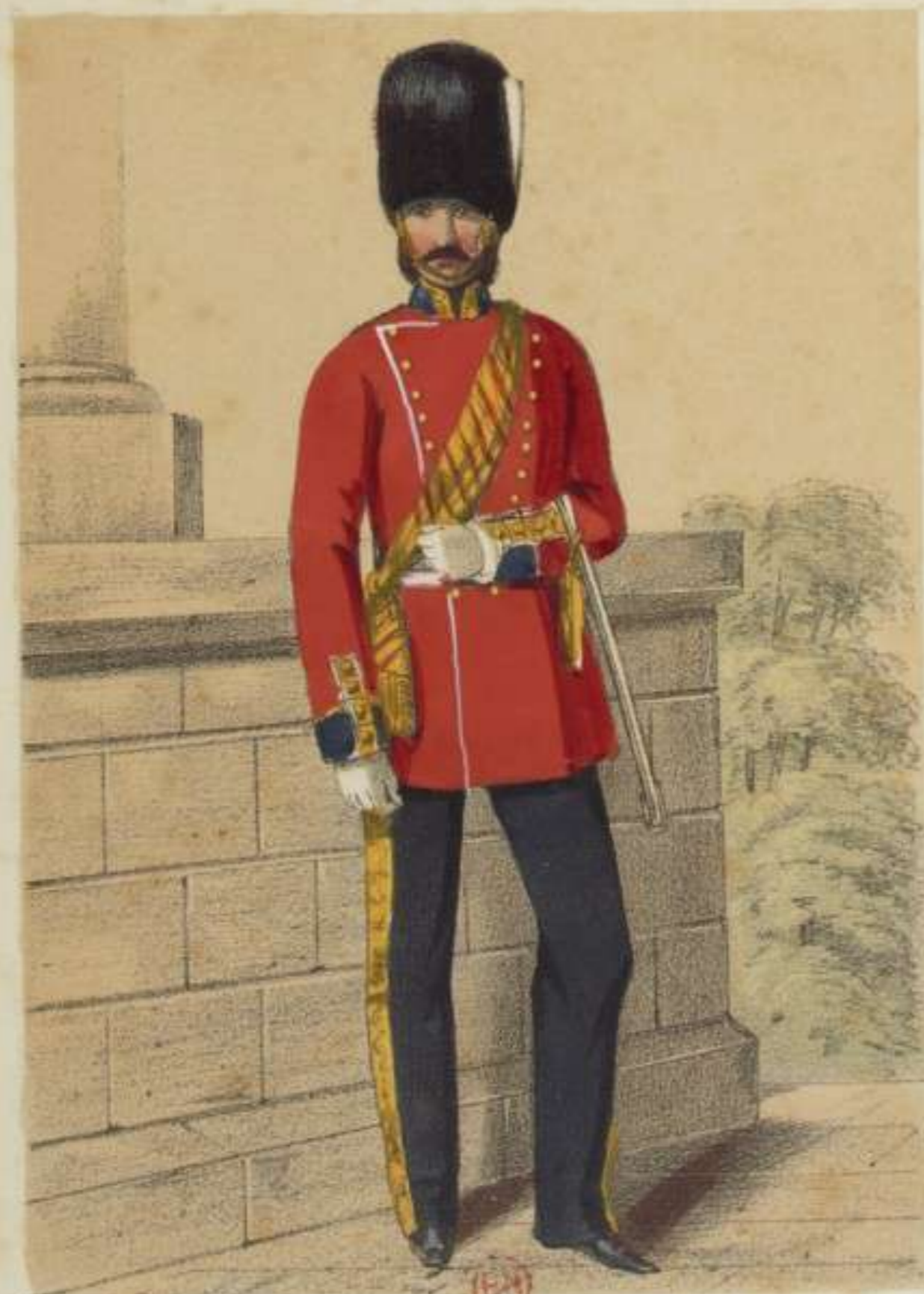
GRENADIER GUARDS. Officer full dress