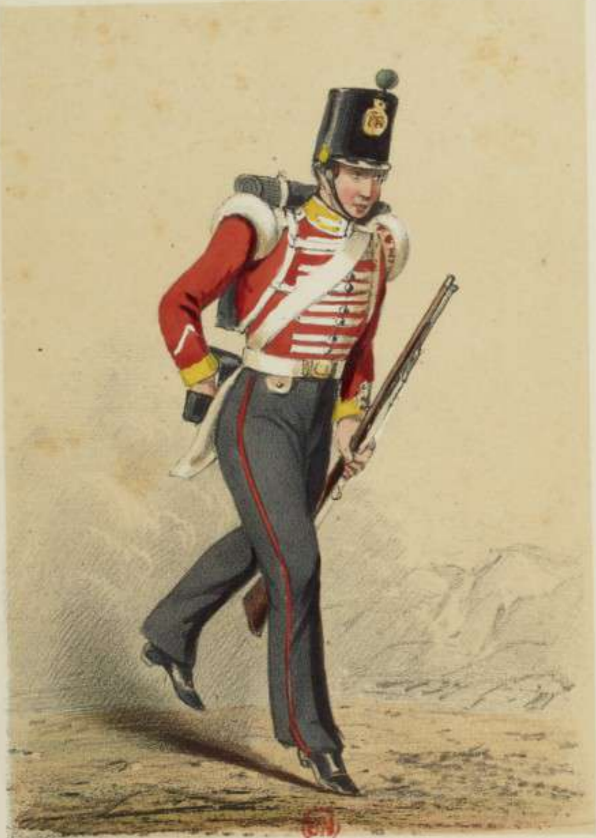
88 th FOOT CONNAUGHT RANGERS (Private of the Light Company)