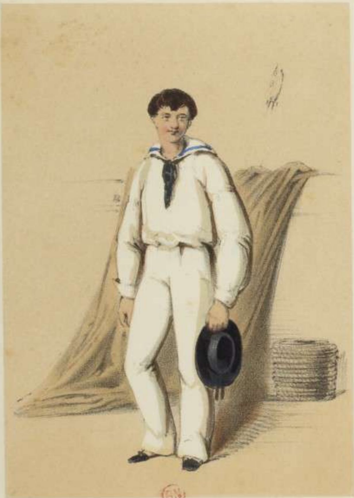
1 ST CLASS BOY.