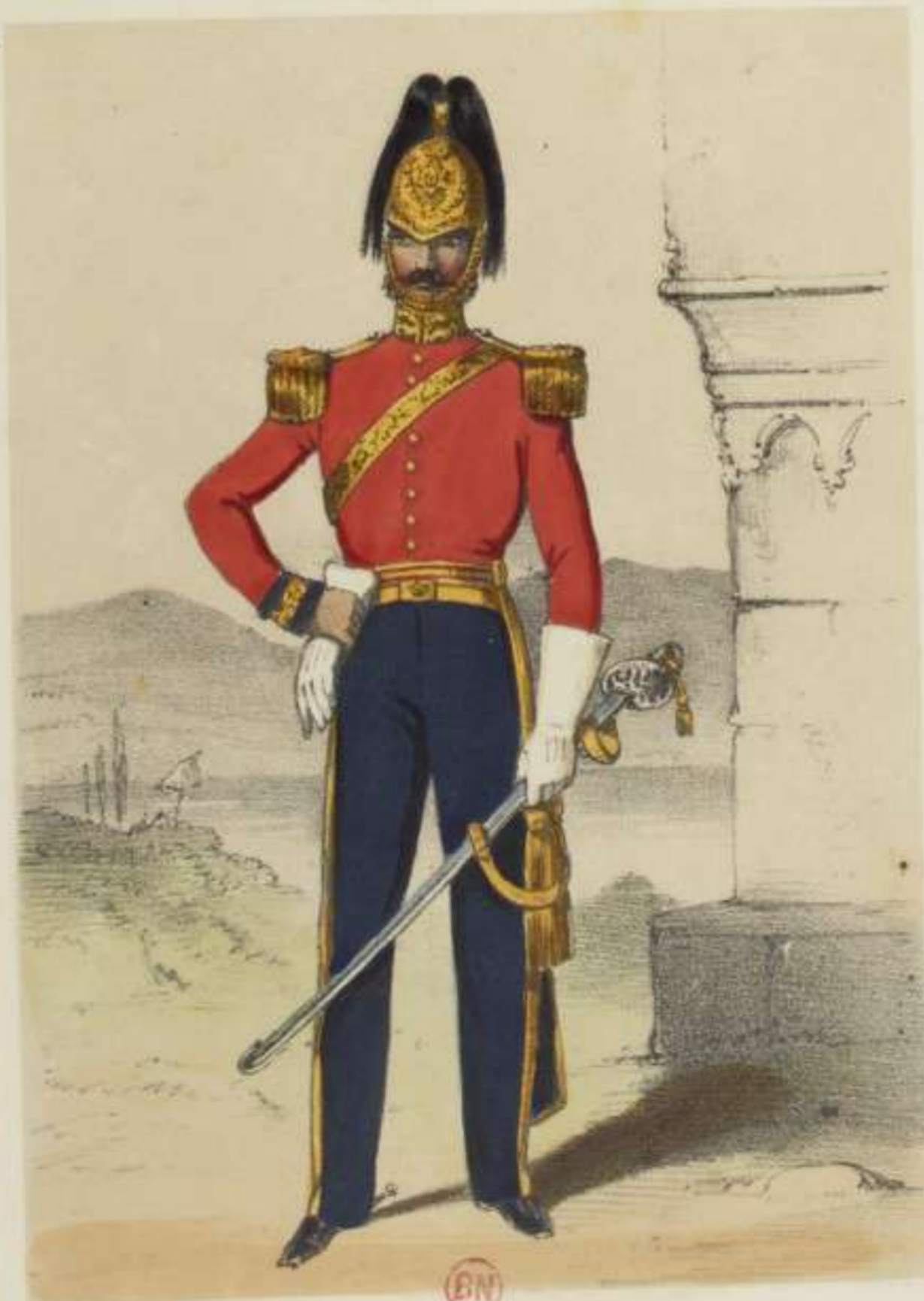
1 ST ROYAL DRAGOONS.