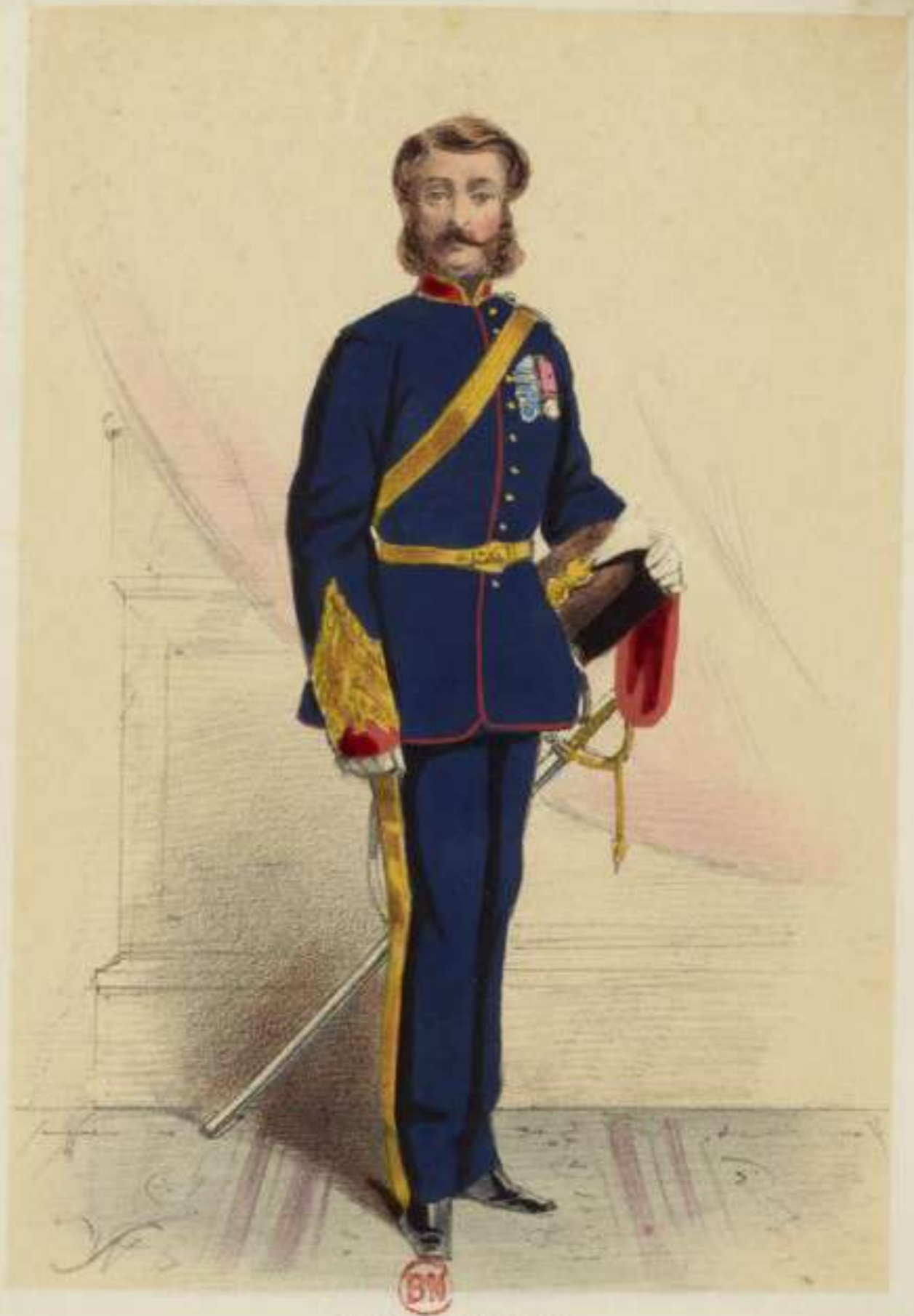
ROYAL ARTILLERY. Colonel