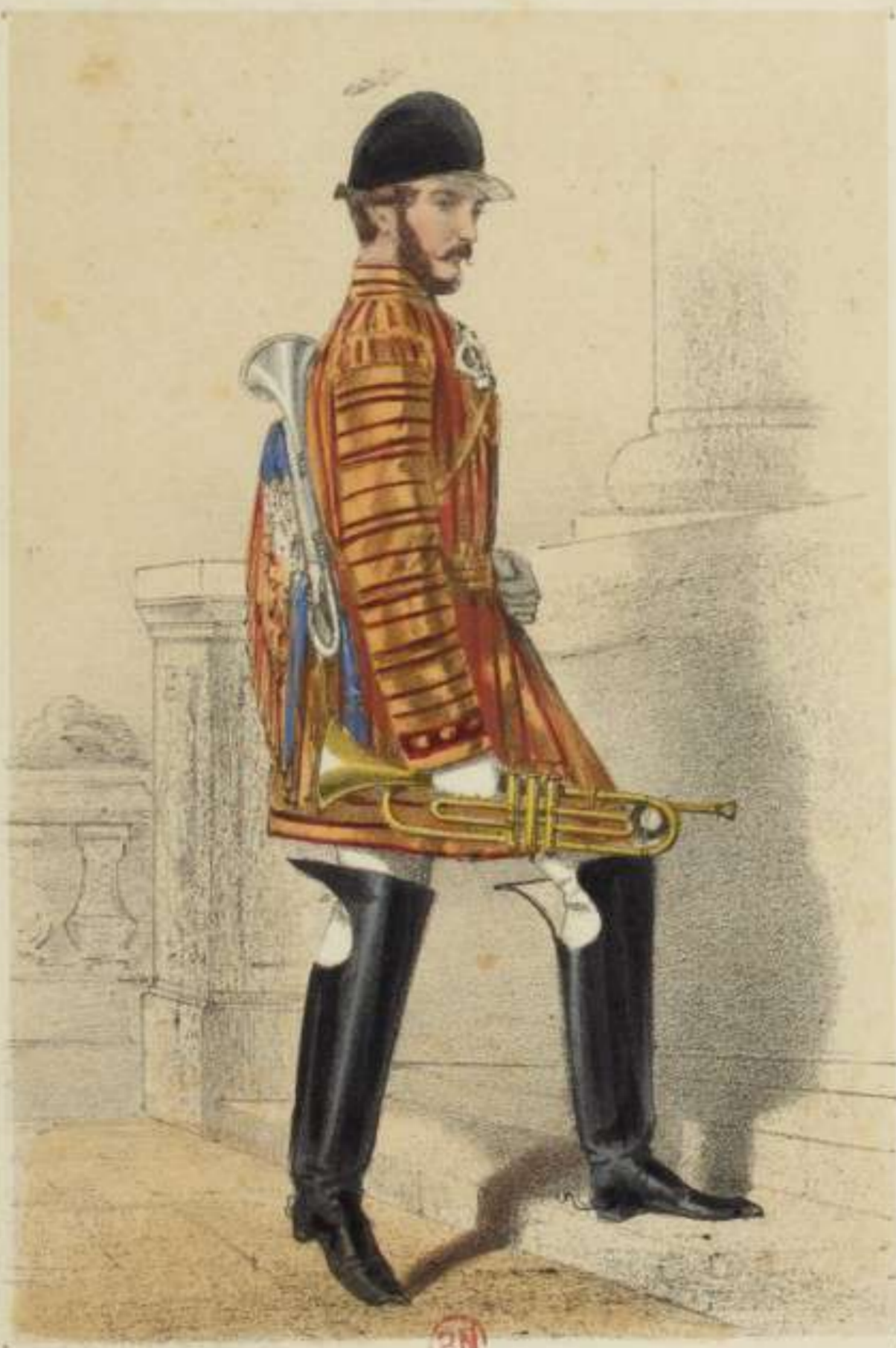
LIFE GUARDS STATE DRESS. Trumpet