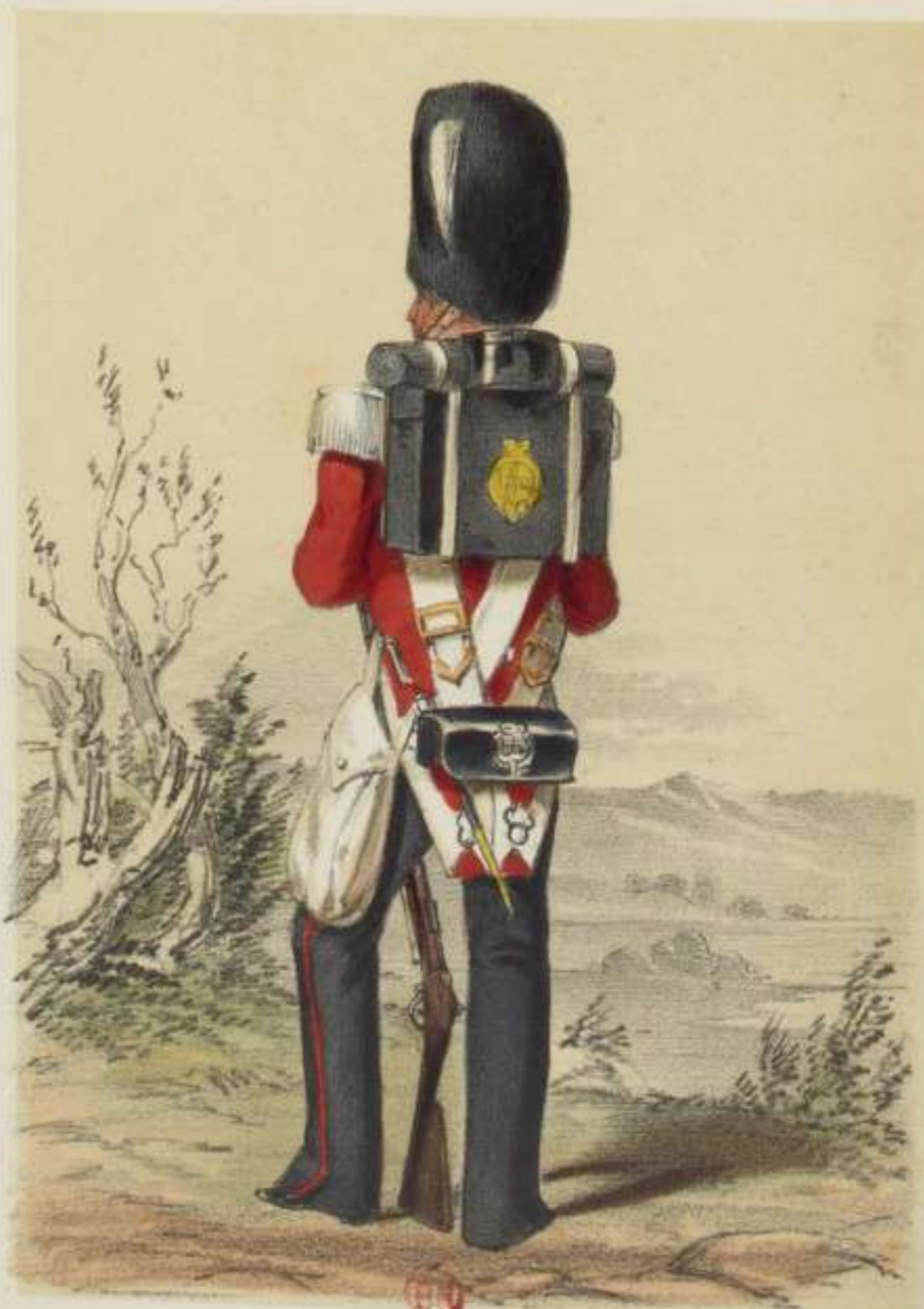
GRENADIER GUARDS. (Heavy Marching Order)