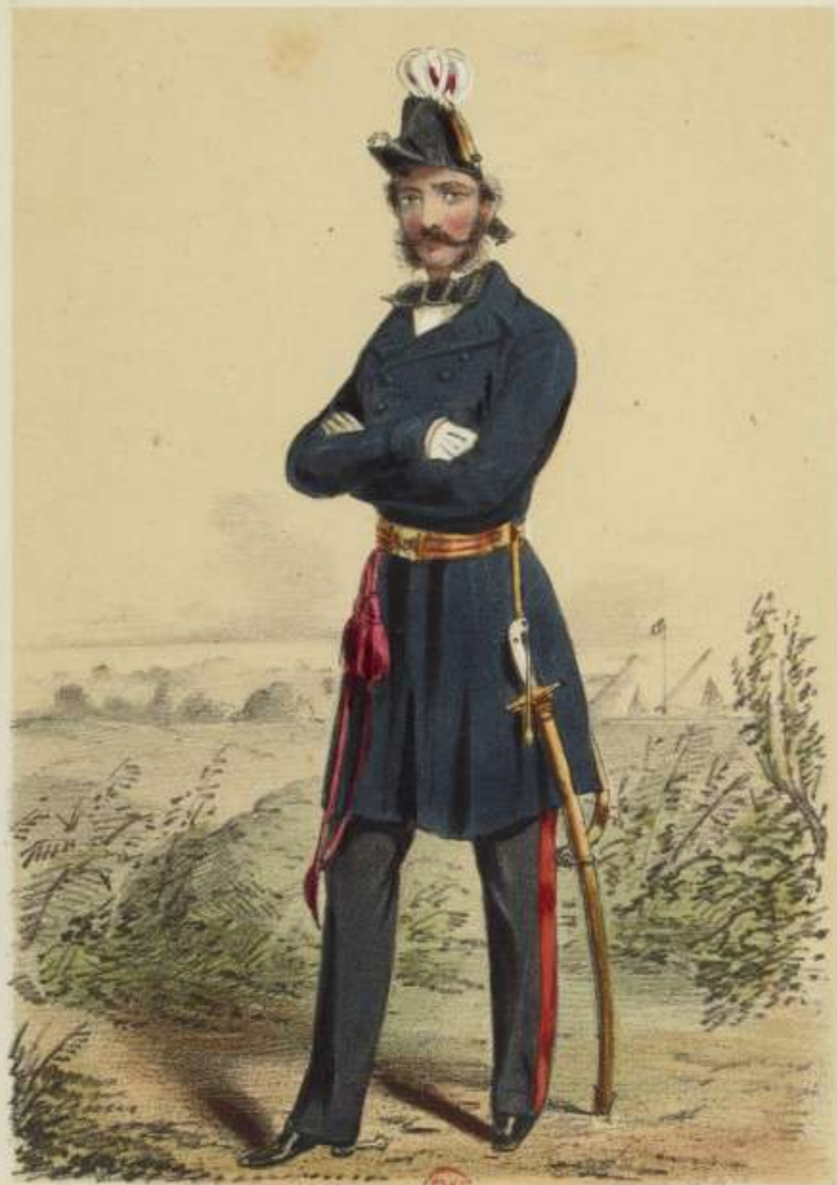
STAFF OFFICER. (Undress)