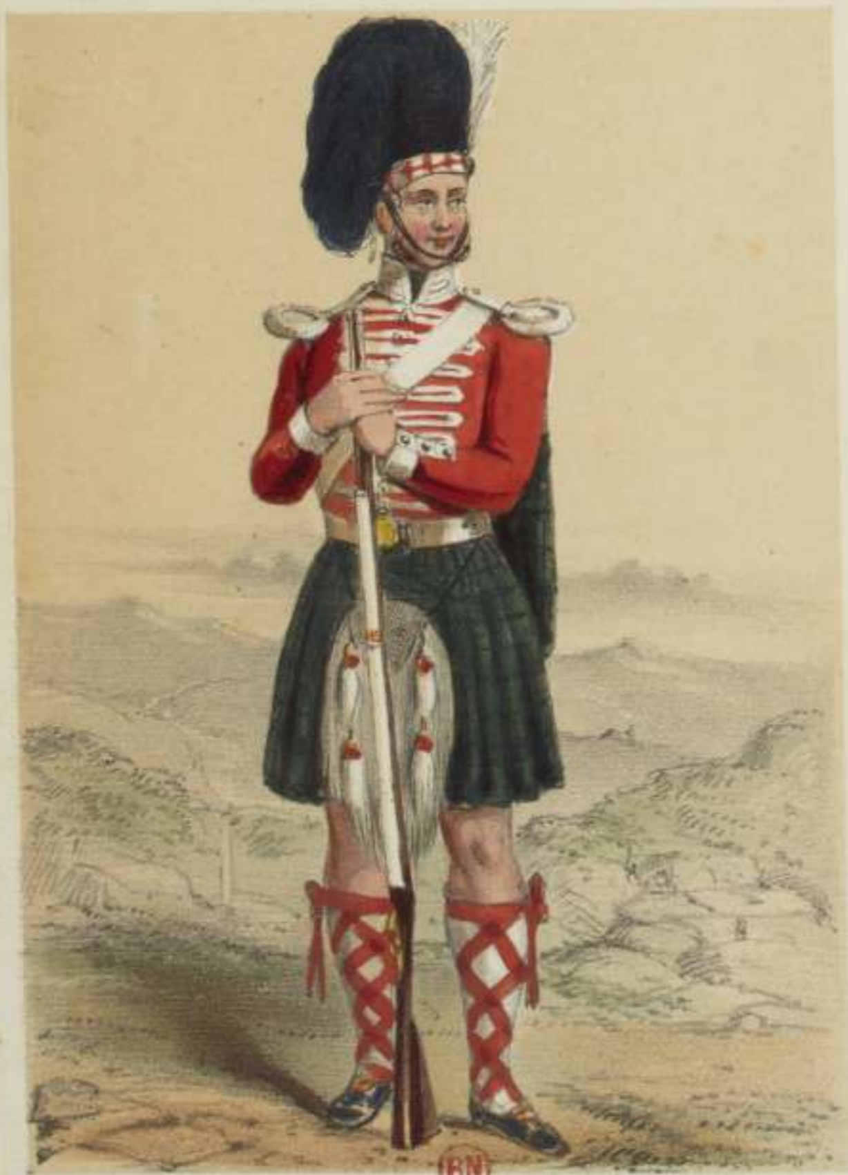
83 rd HIGHLANDERS.