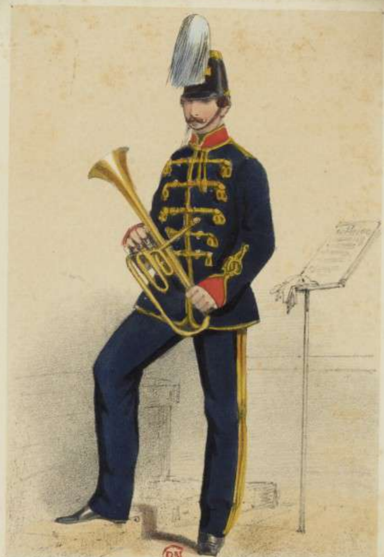
3 RD LIGHT DRAGOONS. Sax Horn.