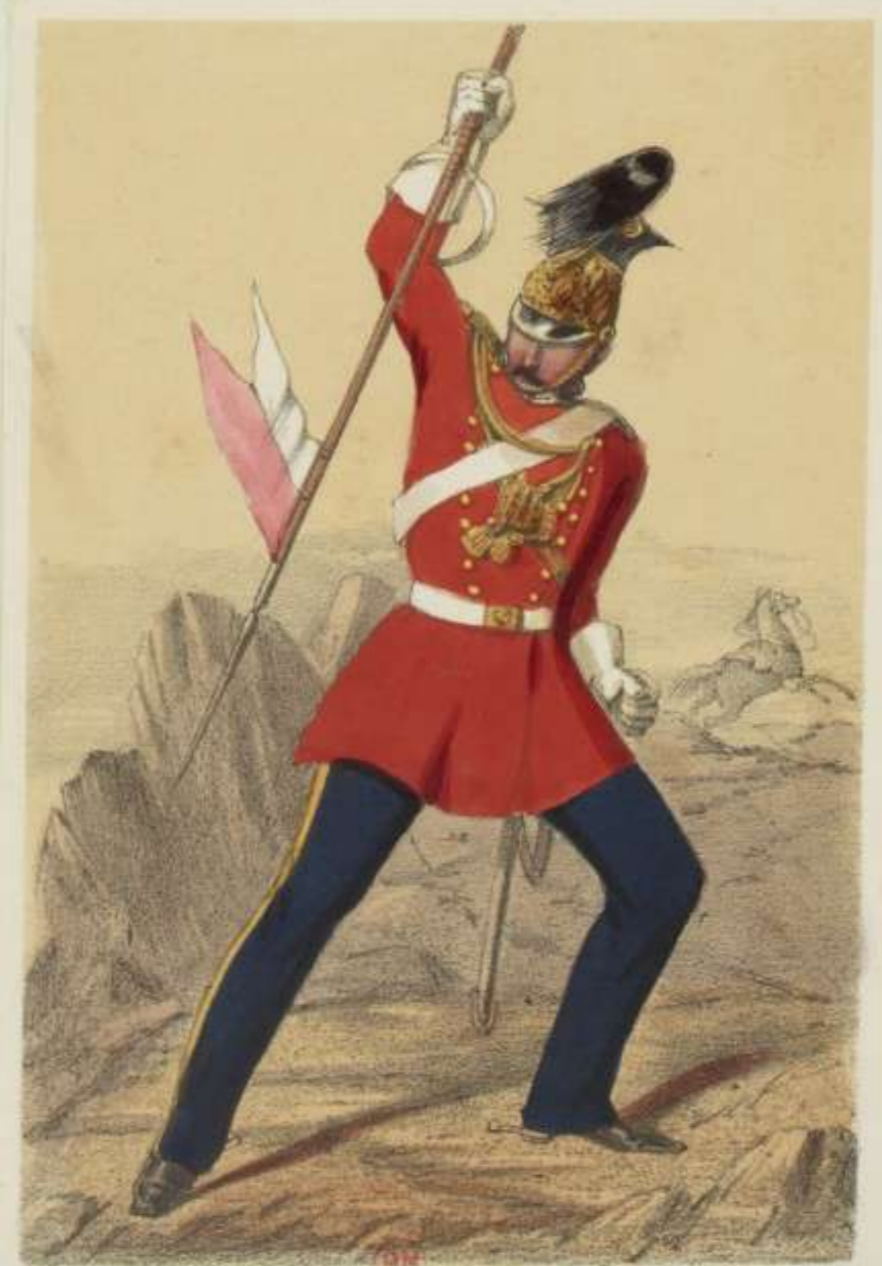
16 th LANCERS.