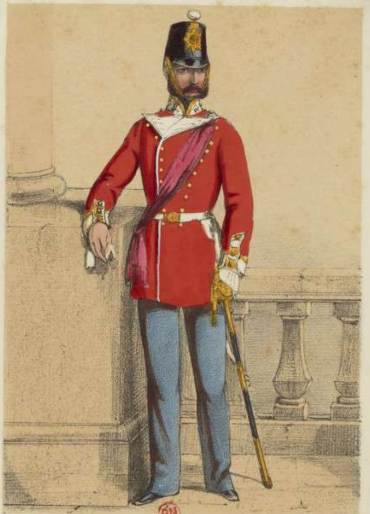
OFFICER OF THE LINE.