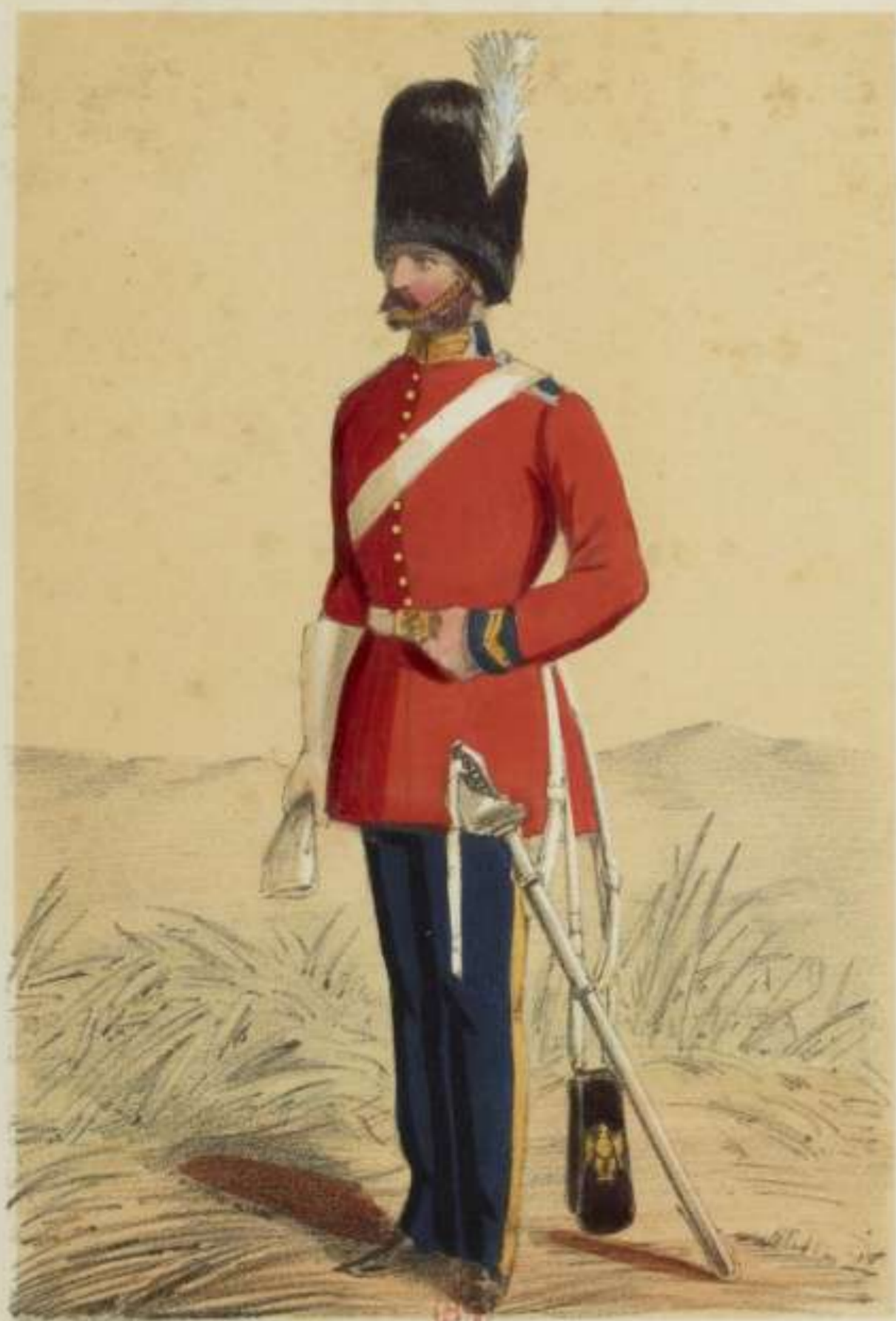
2 ND DRAGOONS.