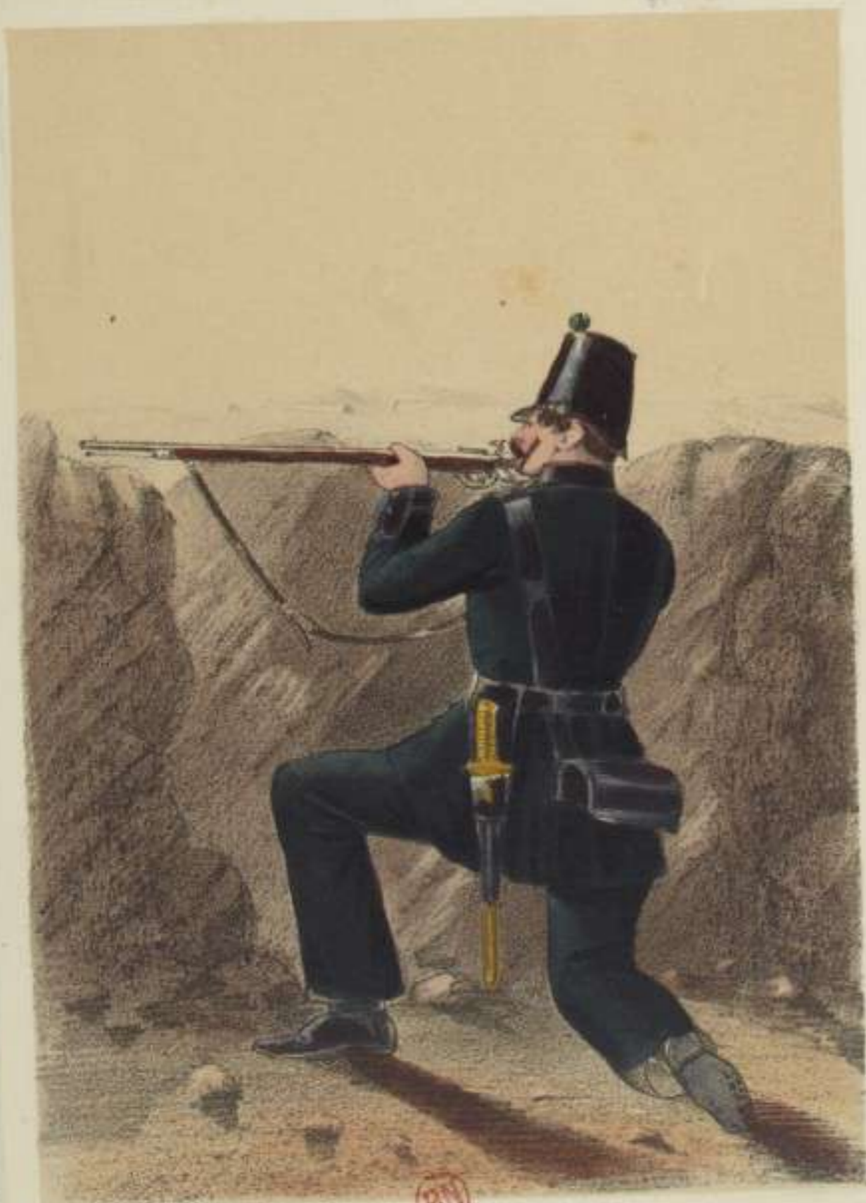
RIFLE CORPS. Private Skirmishing in Pit