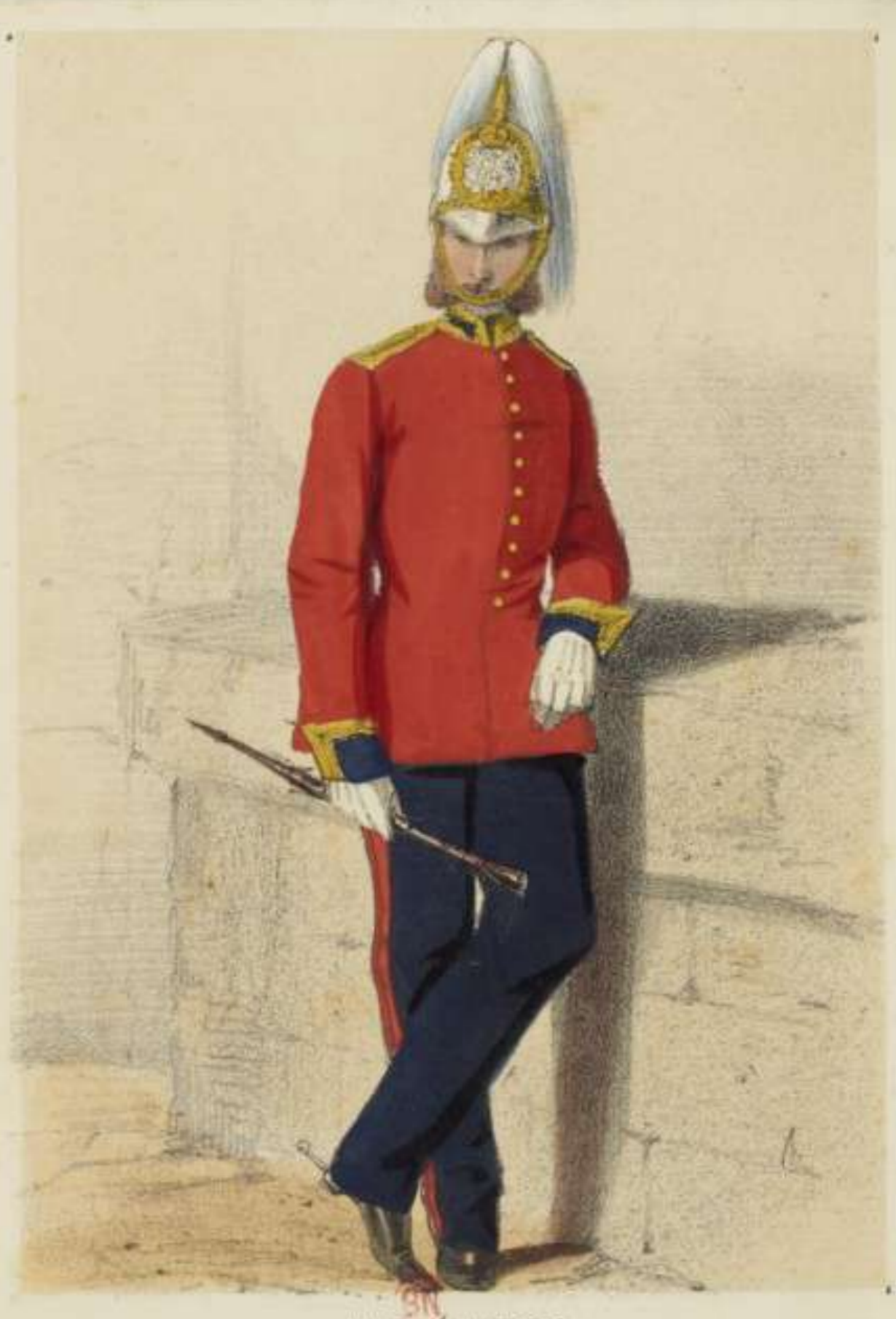
LIFE GUARDS. Oboe.