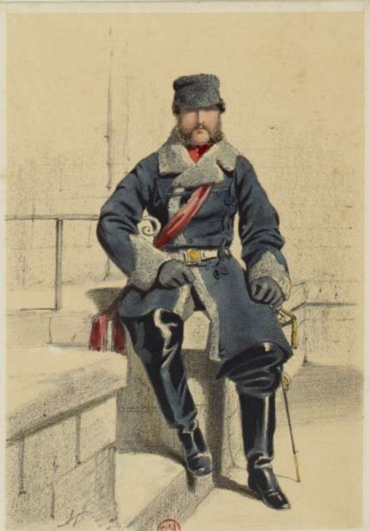
OFFICER OF INFANTRY. Canadian Winter Dress.