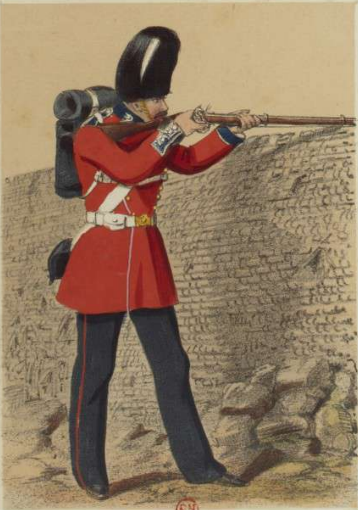
GRENADIER GUARDS. Private