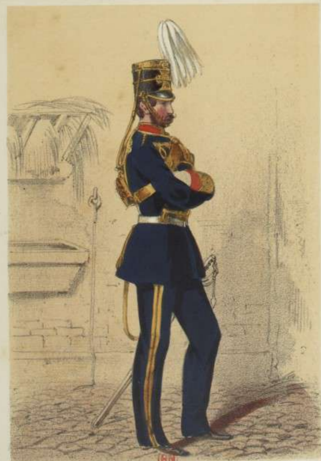
3 RD LIGHT DRAGOONS. (Officer.)