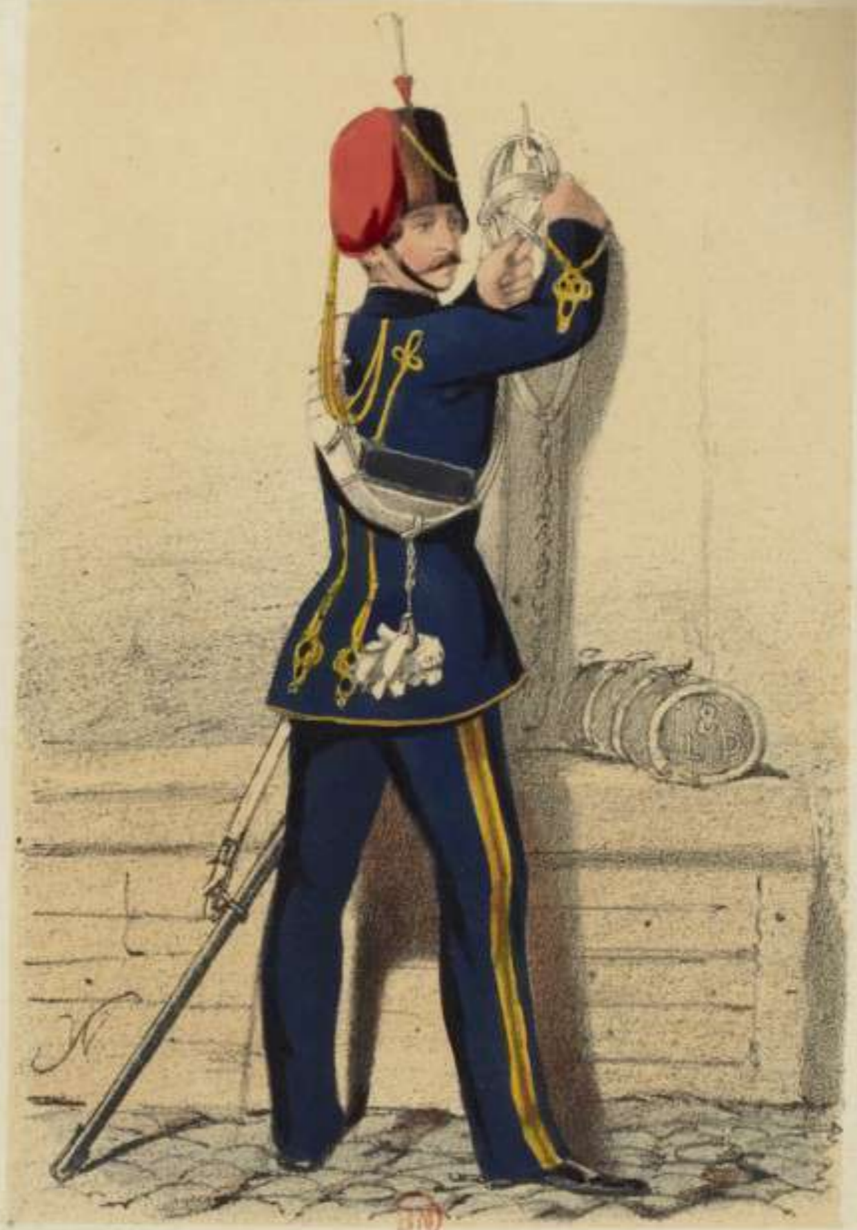
8 th HUSSARS. Private.