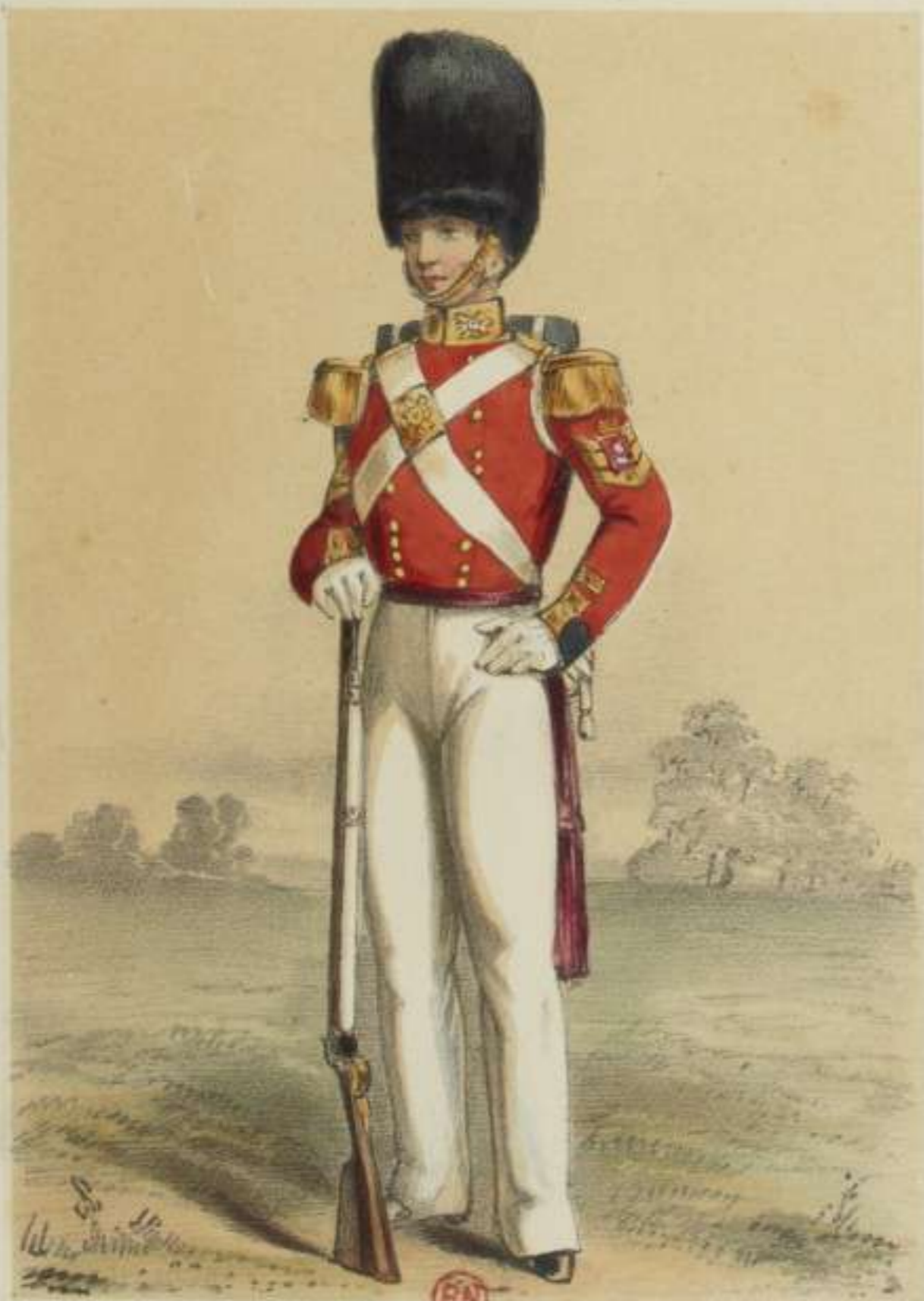
CLOUR SERGEANT. (Scots Fusilier Guards)