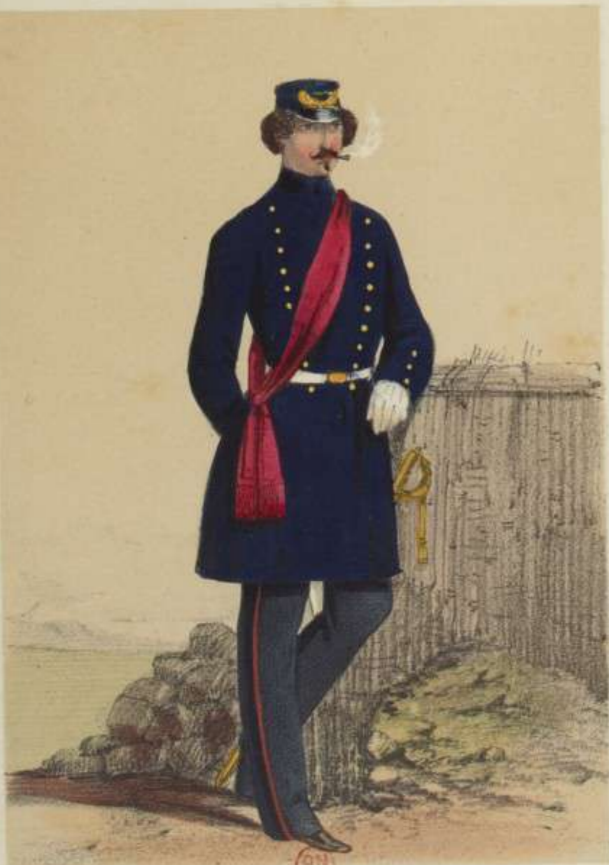
OFFICER OF THE LINE. Undress.