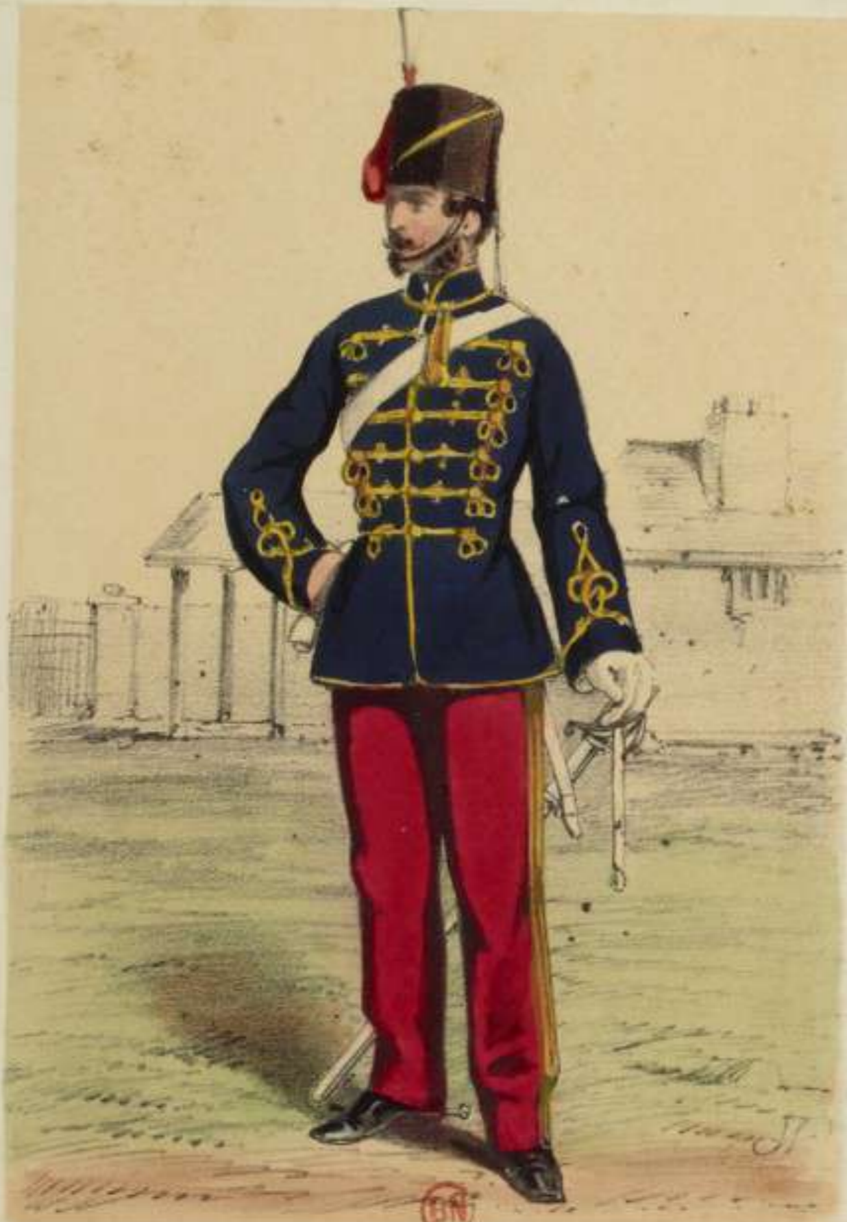
11 th HUSSARS. Private