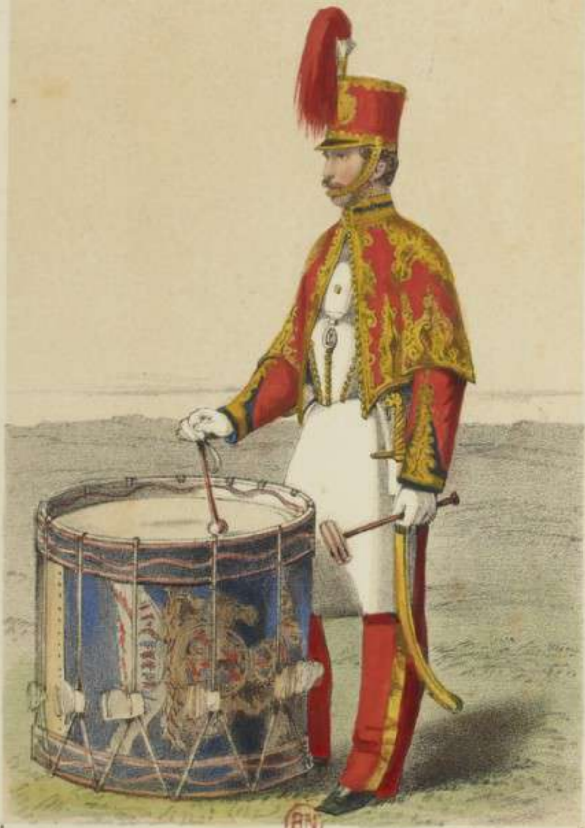
SCOTS FUSILIER GUARDS. Bass Drum