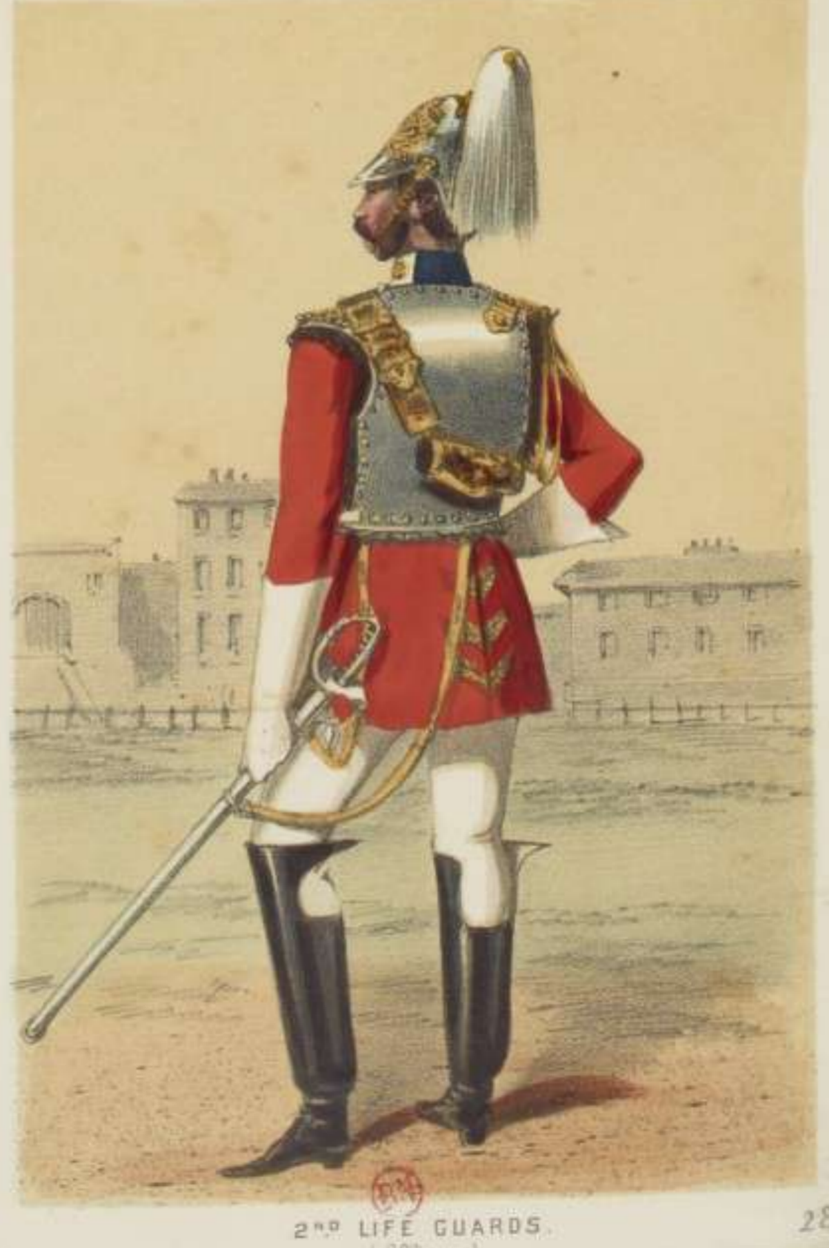
2ND LIFE GUARDS. (Officer)