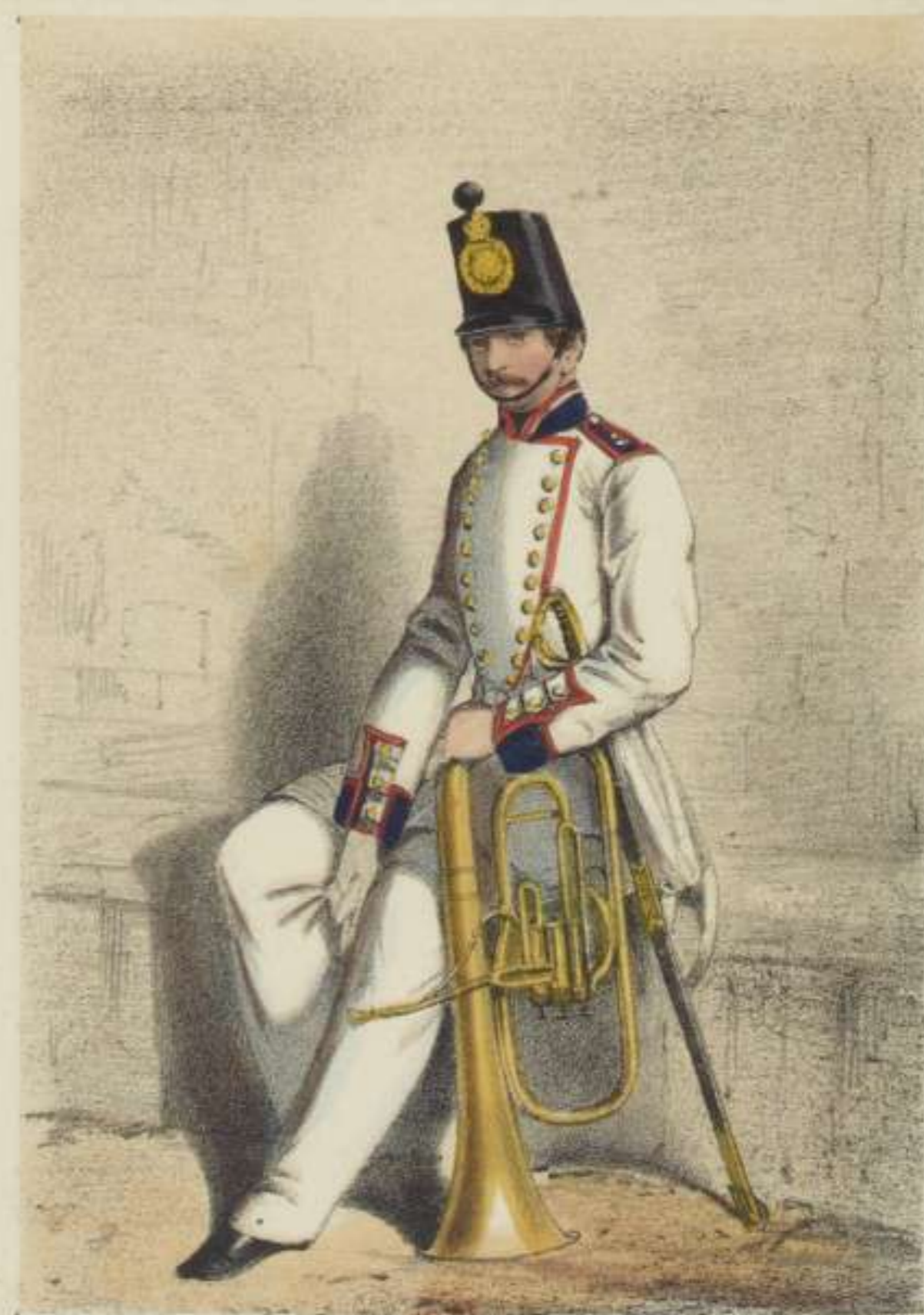
ROYAL MARINES, LIGHT INFANTRY. Alt-horn