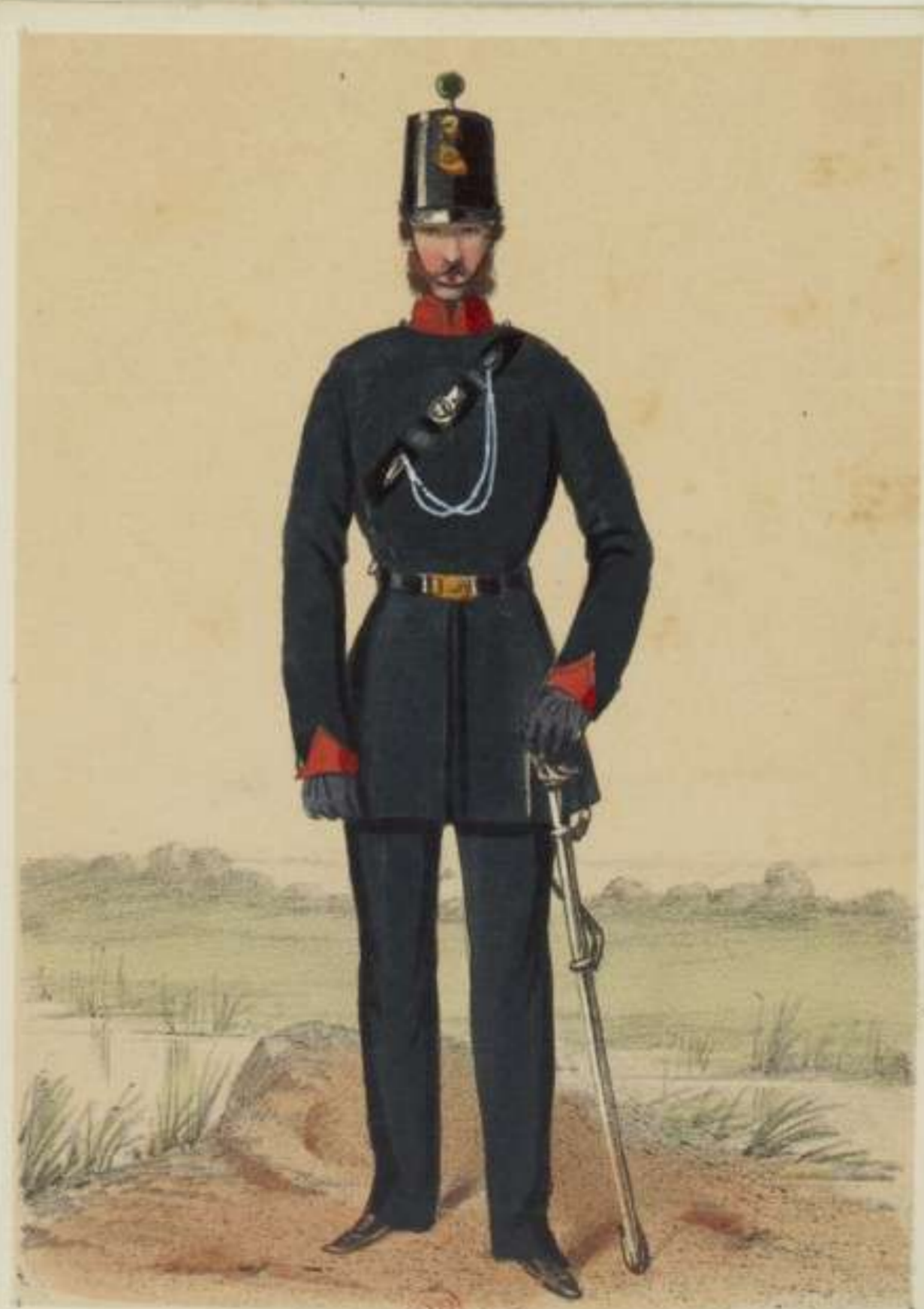
2ND OR EDMONTON ROYAL RIFLE REG'T (Officer)