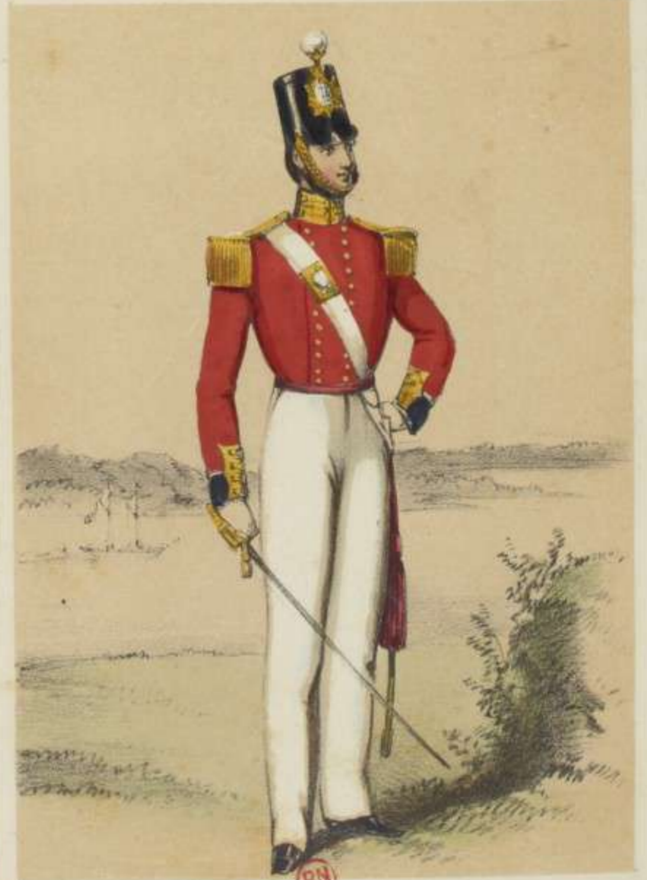
ROYAL MARINES. (Officer)