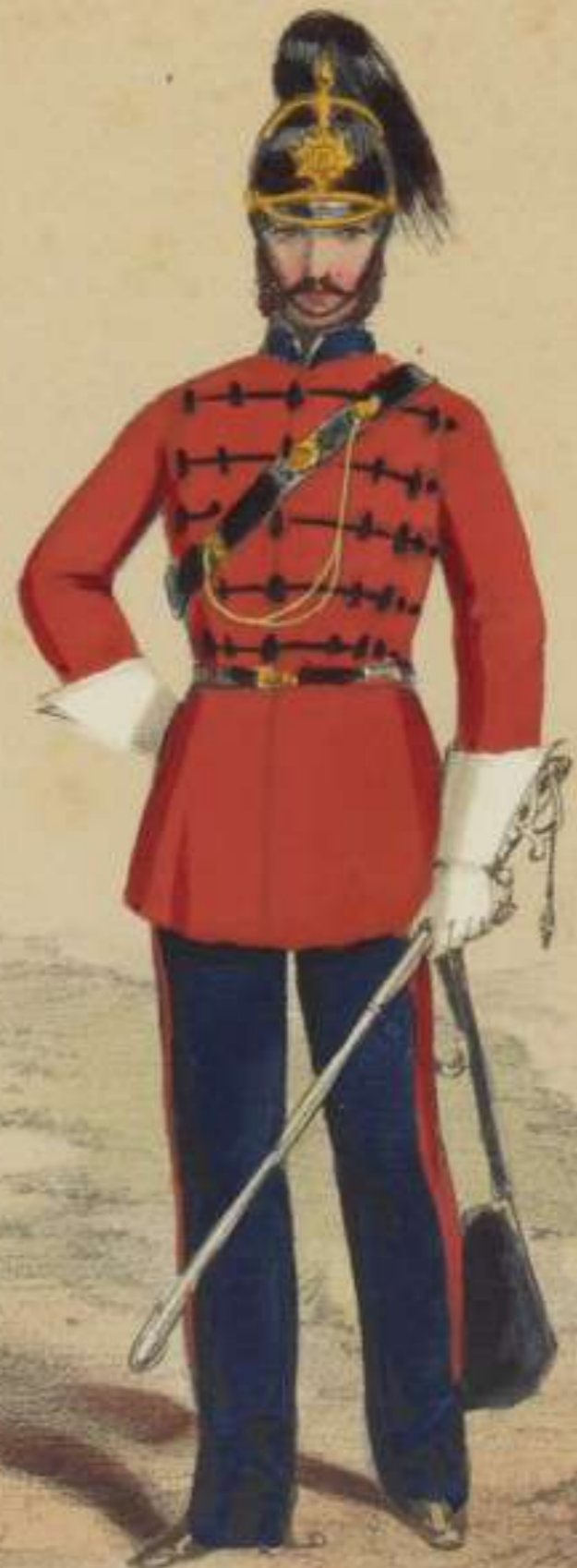
MOUNTED STAFF CORPS. PRIVATE.