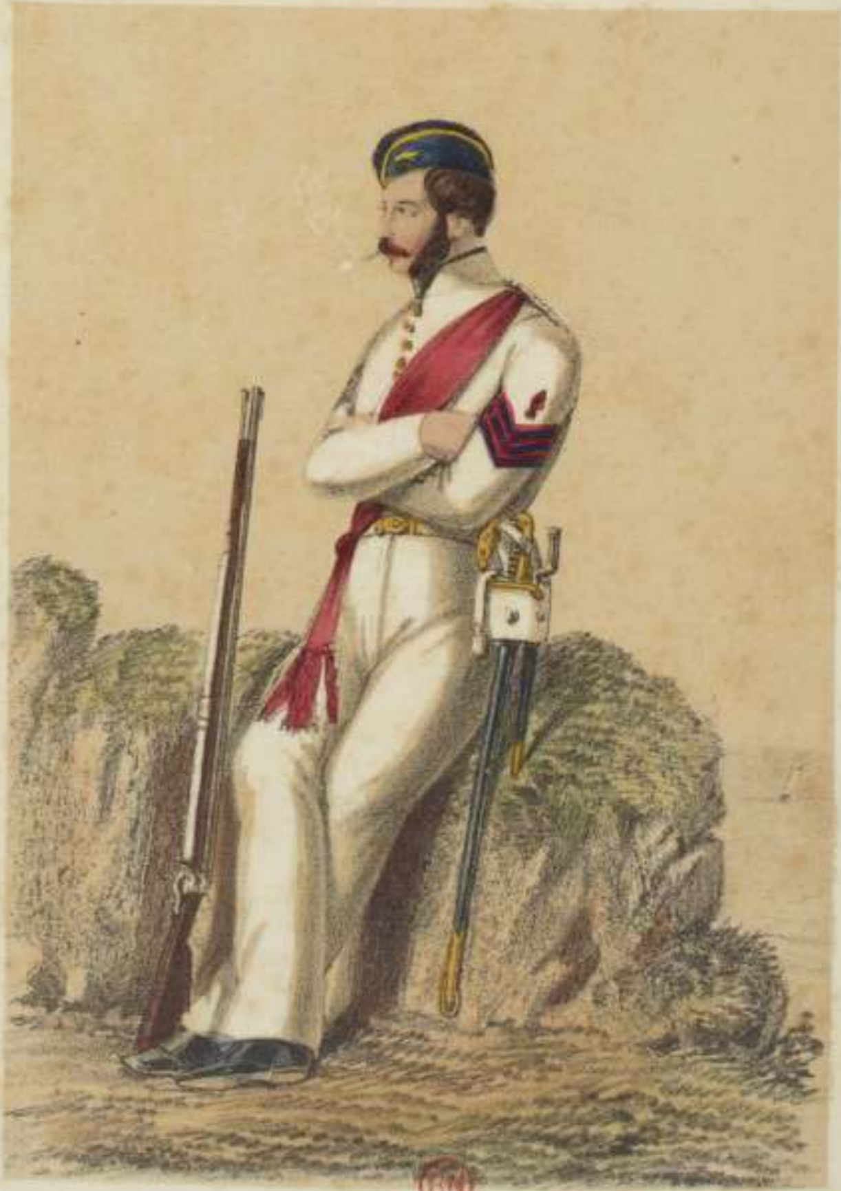
GRENADIER GUARDS. Sergeant in Fatigue dress